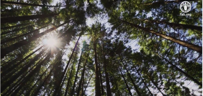
International Day of Forests 2020 website