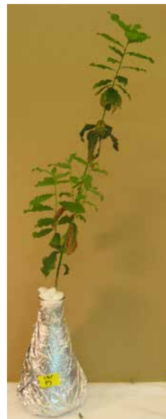
Willow treated with microbe from P. deltooides

nutrients, increasing stress tolerance, and in some cases, detoxifying pollutants that the plants take up. Endophytes are a subset of this microbiota that live within plants and do not cause disease but rather act as symbiotic partners. Polycyclic aromatic hydrocarbons (PAHs) are classified as "priority pollutants" because of their carcinogenicity and toxicity. One of these common PAH pollutants is phenanthrene. Plants can take up this pollutant to some degree but then are killed by the phytotoxicity. The laboratory of Prof. Sharon Doty, chair of the Environmental Applications group of the IPC, isolated a natural microbial endophyte that can break down phenanthrene. When willow or grasses were colonized with this bacterium, they were able to tolerate this normally toxic