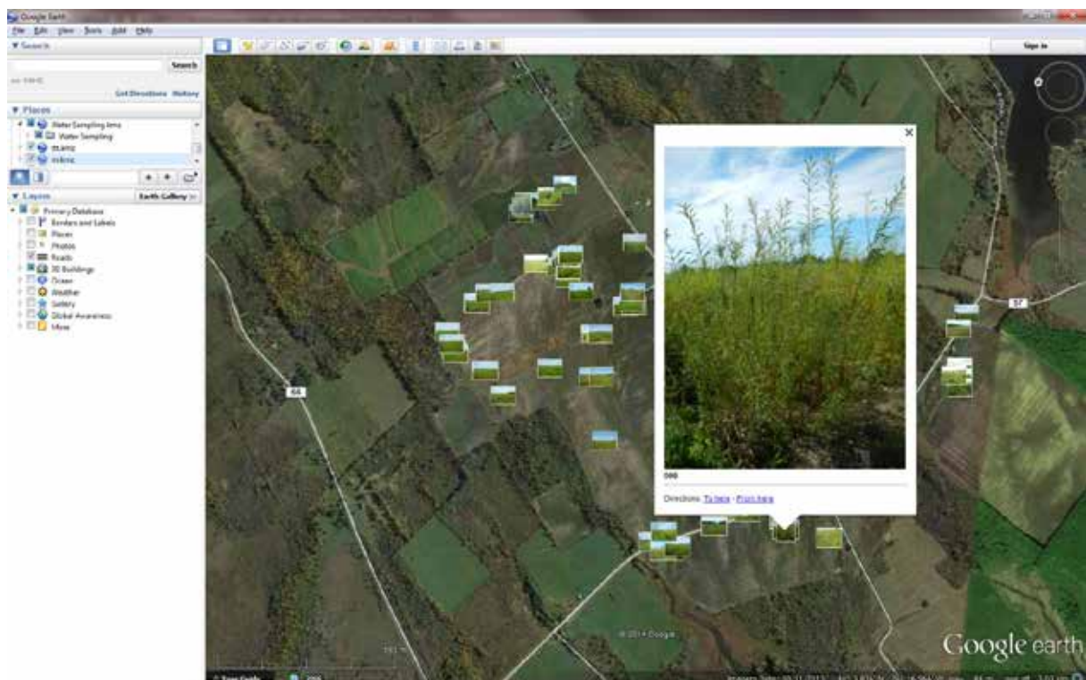
Figure 1: A series of geo-tagged photos across five hundred acres of shrub willow bioenergy crops in New York State, displayed in the Google Earth software program. Each thumbnail on the map can be expanded to provide visual reports of crop conditions, weed and pest pressure in precise locations across large areas.

This technology has been an effective crop monitoring tool for extension staff at the College of Environmental Science and Forestry (SUNY-ESF) who are providing technical assistance to commercial growers managing 1,200 acres of willow biomass crops in Northern New York. Crop monitoring reports, centered around geo-tagged photo-maps created throughout the growing season, allowed extension staff to precisely communicate areas of weed competition and pest outbreak (Figure 2) so growers could quickly implement additional management in targeted areas. Over 800 acres of newly planted willow crops, now one-year-old on a two-year-old root systems, are four to eight feet tall and generally in good condition, thanks in part to this new technology and innovative approach to crop monitoring.