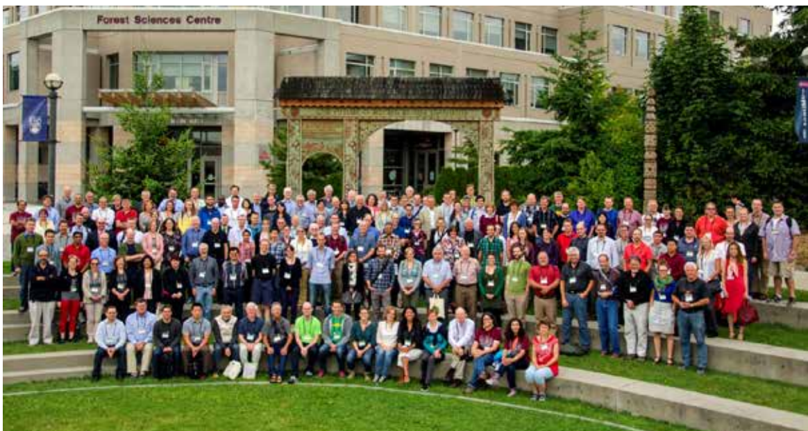
IPS VI participants at the University of British Columbia, Vancouver, Canada.

Presentations given at IPS VI as well as a collection