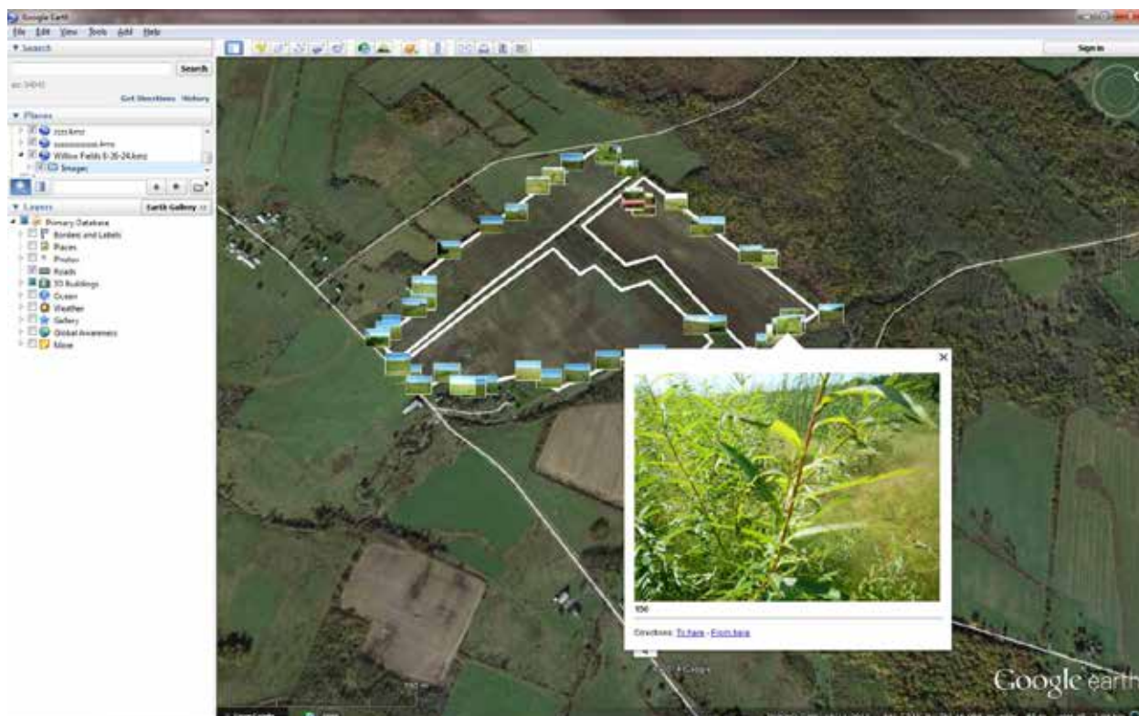
Figure 2: Geo-tagged photos across a 100 acre parcel of new willow biomass crops helped to identify and mitigate isolated outbreaks of "leaf sawfly" in 2014, a willow pest that can completely defoliate a young willow plants if not properly managed.