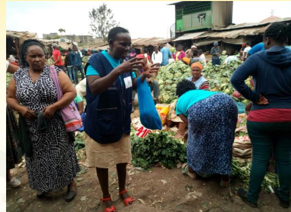
Fresh fruit and vegetable market, Korogocho