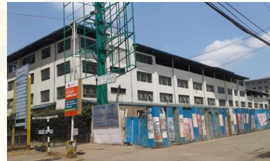
New market under construction, Westlands, Nairobi