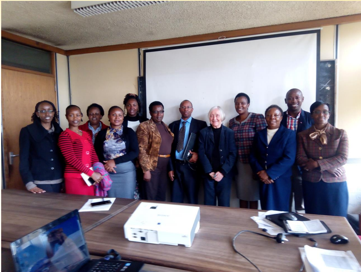
Members of Cross-sectoral Consultative Group on 4/6/19