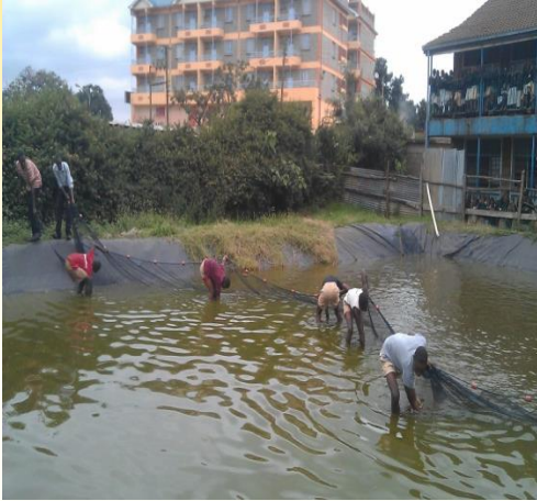
Demonstration of fish harvesting & vegetables production on cone garden