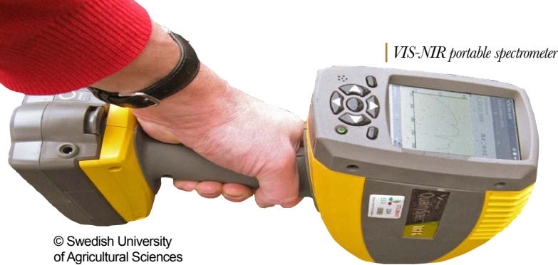
VIS-NIR portable spectrometer