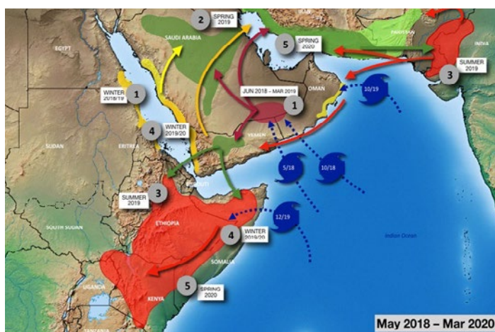
Figure 2. Development of the current crisis

Map conforms to UN, 2020. Map of the World.