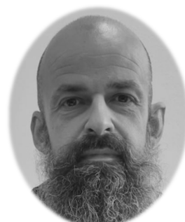
Lorenzo Costa "La Scoscesa" farming cooperative, Siena (Italy)