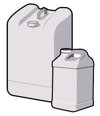
Containers with water-based insecticides