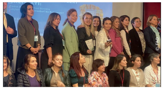
A photo captured the women-led agricultural development cooperatives participating in the event