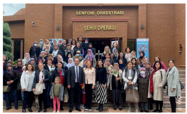
Women farmers and entrepreneurs.

Within the scope of World Food Day, an event entitled "Women Making a Difference in Agriculture" was organized in Eskişehir in partnership with the Eskişehir Metropolitan Municipality. The event provided a forum for women entrepreneurs in agriculture to share their success stories and experiences, which have inspired many women farmers and entrepreneurs, especially in rural areas.