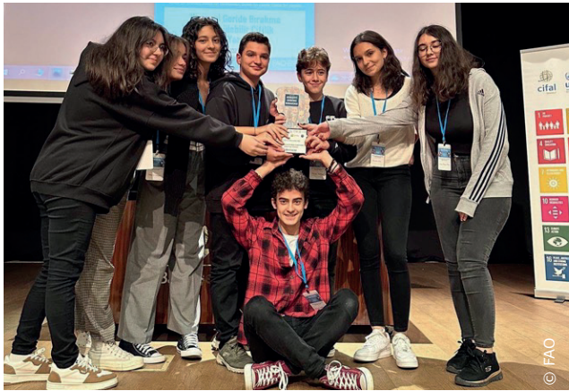
Students from Bahçeşehir University at the Sustainable Farm Project Competition.

The decisions we make today regarding agriculture and food affect our future. It is possible to save natural resources and reverse natural degradation by implementing sustainable solutions for farming. In this context, FAO-Türkiye and Bahçeşehir College jointly launched the "Sustainable Farm Project" competition at Kemerburgaz campus. The students who took part produced farm projects that conserved resources such as soil and water and minimized waste and environmental impacts. Their involvement and the participation of other young people is vital to the future of in agri-food systems.