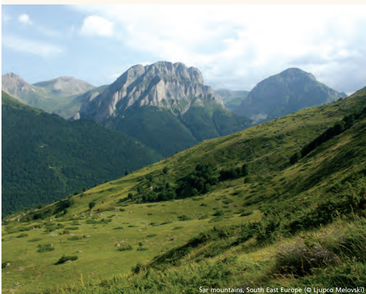
Šar mountains, South East Europe

Both the challenges and opportunities for substantial improvement in all aspects of transboundary and national sustainable mountain development are enormous, with success stories leading to increased regional collaboration and stability. As the European and global experience show, the challenges of sustainable mountain development cannot be effectively solved without intergovernmental cooperation. As an example, in the Carpathian region, international cooperation within the Framework Convention on the Protection and Sustainable Development of the Carpathians provides a solid base for measures to balance environmental protection and sustainable regional development, and to improve the living conditions of the local population.