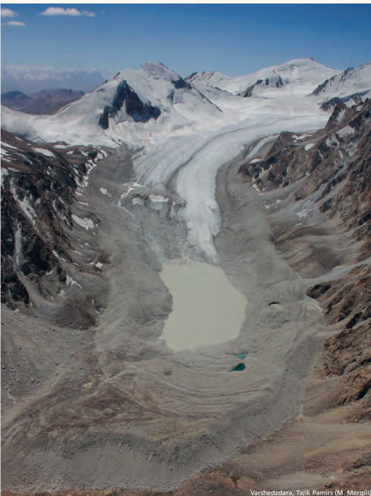
Varshedzdara, Tajik Pamirs (M. Mergili)

The mountains of Central Asia provide a profound sense of place, a source of inspiration and a rich cultural heritage.