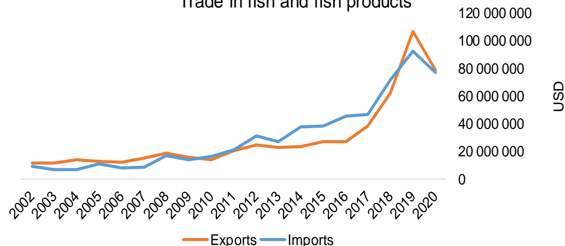
Trade in fish and fish products