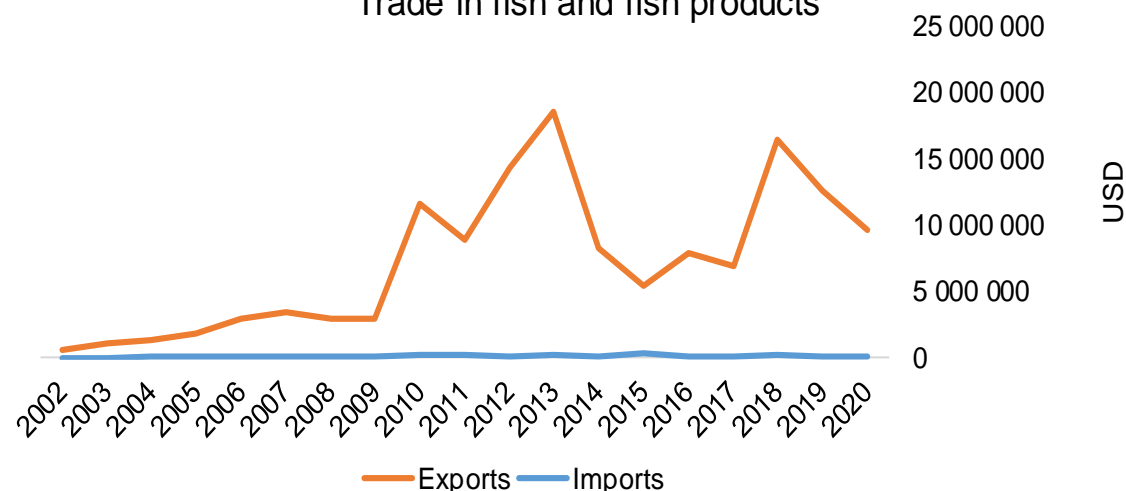
Trade in fish and fish products