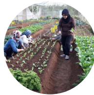
FAM Organic Sustainable healthy soils Indonesia