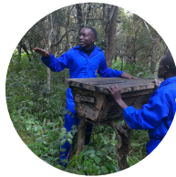
Wuchi Wami Organic raw honey Zambia