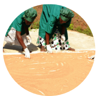
Amaati Group Empowering rural women Ghana