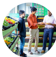
Farmers Fresh Zone Connecting farm to fork India