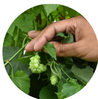
AgriLeap Hydroponic hop cones South Africa