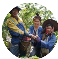
Yoddoi Organic Coffee Hill tribe coffee Thailand