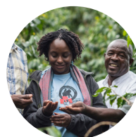
Gorilla Conservation Coffee Saving gorillas with each sip Uganda