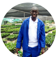
Mooto Cashew Reforesting through food Zambia