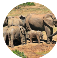
Kalahari Honey Sustainable beekeeping Botswana