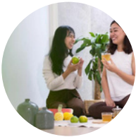
Rahsa Nusantara Ethical natural drinks Indonesia