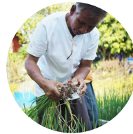
ListenField Digital farming Thailand