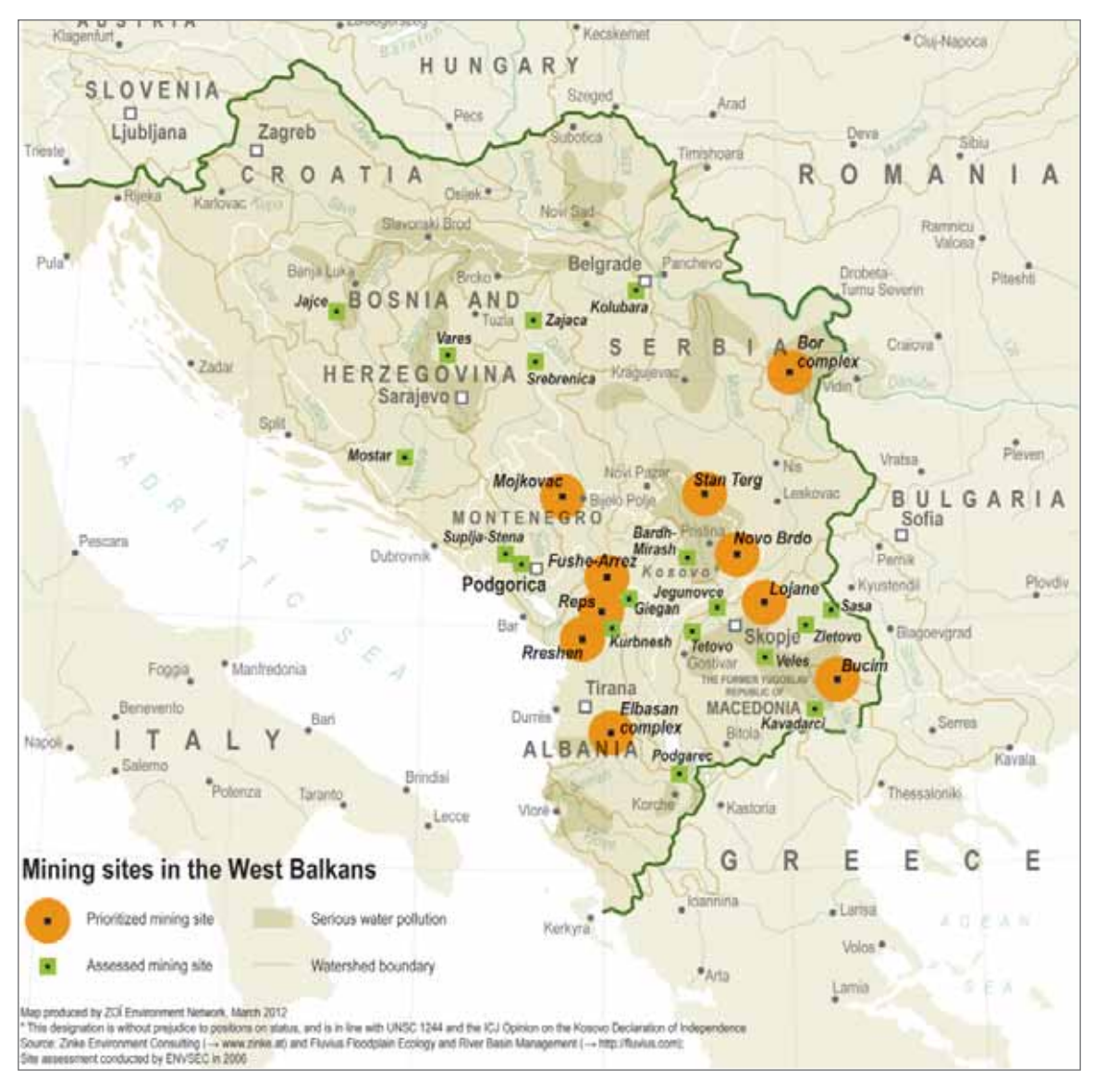
Figure 5. Mining sites in the Western Balkans