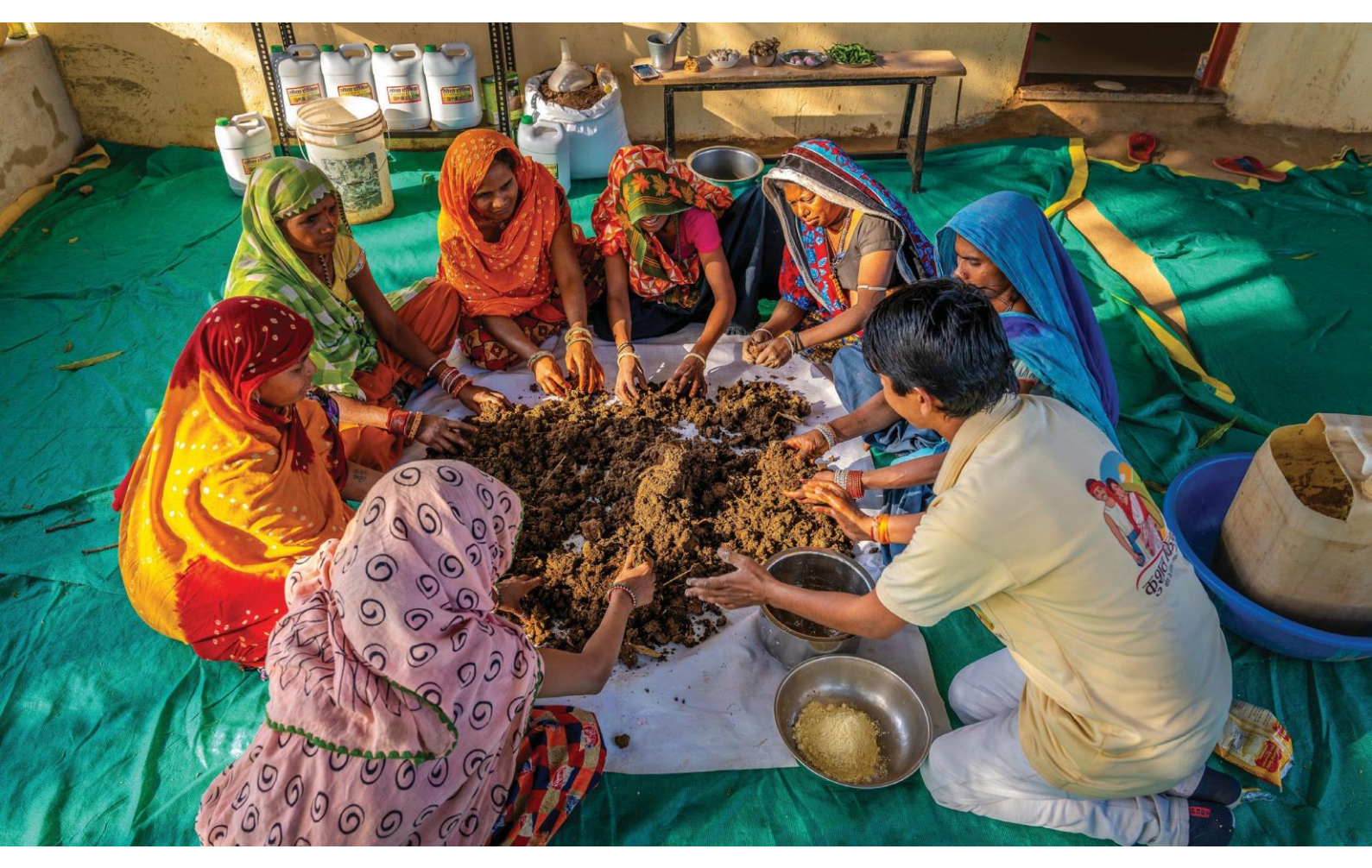
Active FPO members engaged in organic manure preparation

the value addition done by NAFPO in FPO ecosystem building. NAFPO has partnered with SFAC & Samunnati to promote 100 All Women Farmer Producer Companies (FPCs) across five states, namely, Madhya Pradesh, Uttar Pradesh, Jharkhand, Chhattisgarh and Assam, to empower and accelerate growth by augmenting incomes of small and marginal farmers. This is a long-term partnership, with FPOs registered and promoted by NAFPO, which will also enable us to provide comprehensive capacity building programs for FPOs along with implementation of digital tools. It is a strategy for facilitating end-to-end support to FPOs right from registration, market, financial linkages, technology, and capacity building.