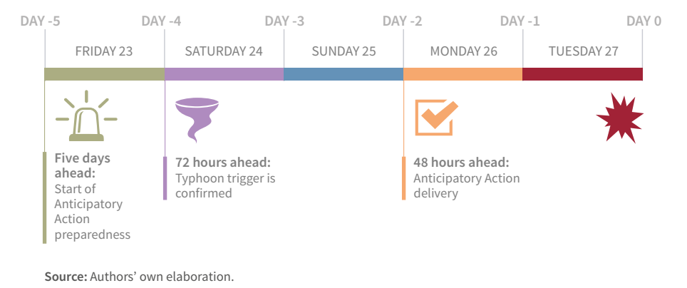
Figure 2. Timeline of Anticipatory Action interventions for Typhoon Noru

Typhoon Noru made landfall at 1 a.m. on 28 September 2022 between Da Nang and Quang Nam provinces, with wind speed of 117 km per hour, equivalent to a Category 1 hurricane (and more than 429 mm of rain in Quang Nam).