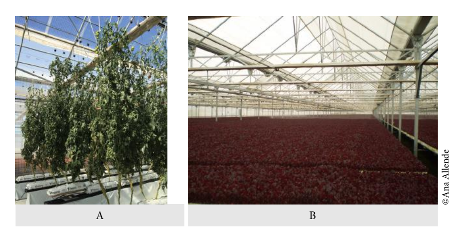
Figures 2. Examples of greenhouses using hydroponics (A) and substrates (B)

• Examples of greenhouse using soil (Figure 3).