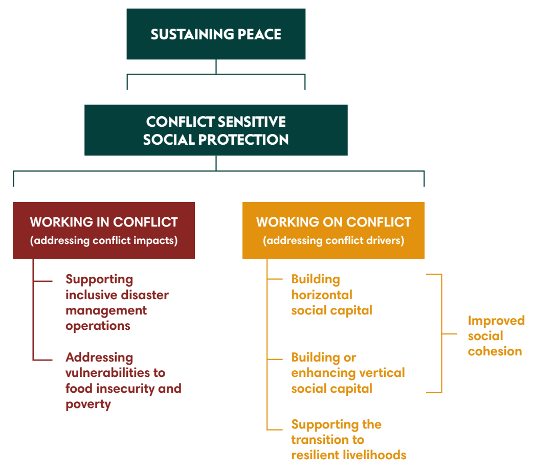
FIGURE 2. SOCIAL PROTECTION'S CONTRIBUTIONS TO SUSTAINING PEACE

A first contribution that social protection systems can make to address the impacts of conflict, if they are sufficiently mature, well-structured and still functioning despite the conflict, is responding adaptively by scaling up vertically or horizontally to ensure increased support is provided to vulnerable households, while also extending assistance to new groups of the population that have become vulnerable as a consequence of conflict. In both