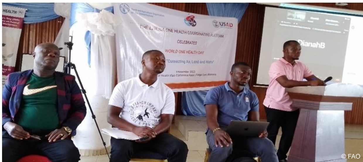
Panel Discussion on One Health Issues at the Human, Animal and Environment Interface

The presentations were followed by a panel discussion with significant contributions, remarks and questions by the participants.