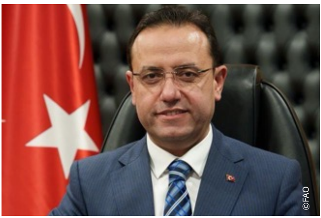
Ebubekir Gizligider, Deputy Minister of the Ministry of Agriculture and Forestry

Climate change, natural disasters and ongoing conflicts in various parts of the world have all demonstrated the importance of safe and accessible food for human health. Unfortunately, a significant portion of the world's population still face food insecurity and malnutrition.