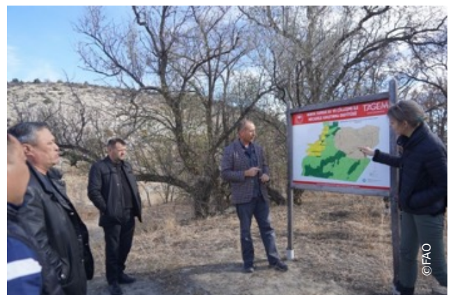
FAO-Türkiye partnership expands to Nigeria's Borno state with crop diversification project for drylands

The project inception meeting was held online on 6 November 2023, and was attended by high-level officials and relevant experts from Nigeria and Türkiye.