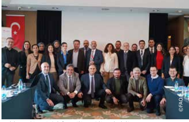
Workshop participants in Ordu from Tajikistan, Türkiye and Uzbekistan

As part of the project "Leaving no one behind: Greater involvement and empowerment of rural women in Türkiye and Central Asia", a two-day regional workshop, held in Ordu on 13–14 December 2023, brought together participants from ministries and government institutions of Tajikistan, Türkiye and Uzbekistan. Within the scope of the workshop, government officials working in agriculture, forestry and food security shared experiences from their organizations related to socially inclusive and gender responsive policies and practices that address the needs of rural women at a risk of being left behind. The workshop also included visits to gender units created by MoAF and meetings with rural women benefiting from the programme.