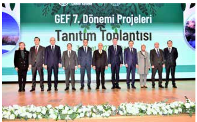
GEF 7 launch event organized in cooperation with MoAF

The year also saw an increase in the visibility of the FAO Türkiye Partnership Programmes (FTPP) in international fora. A regional workshop dedicated to the FTPP took place on 24 January in Baku, to discuss the results and successes