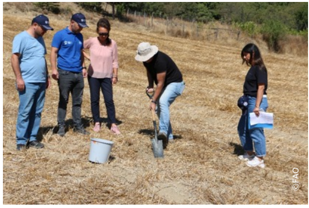
Over 50 participants received training including technical personnel, representatives of NGOs and farmers

As part of the project "Enhancement of Agro-Ecological Management Systems through Promoting Ecosystem-Oriented Food Production", practical agro-ecological training sessions were provided to district farmers in the Seben and Yeniçağa districts of Bolu, including detailed explanations on how and when to collect soil samples. The training was attended by over 50 participants including technical personnel, representatives of NGOs and farmers. Following the theoretical sessions, soil samples were collected with farmers from 17 different locations districts to create pilot demonstrations for agro-ecological practices.