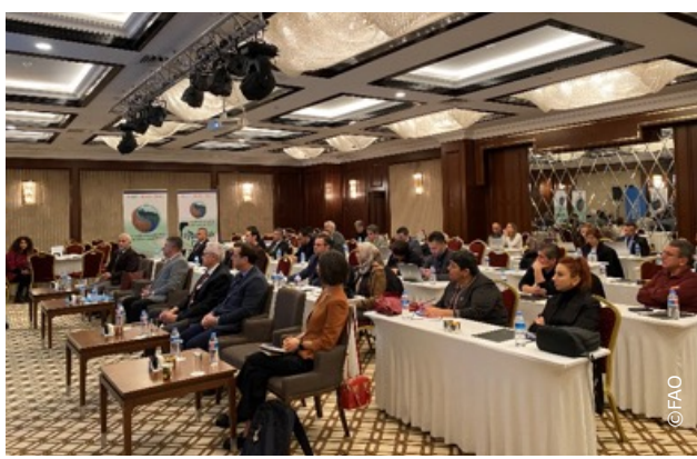
FFS Curriculum Workshop held in Ankara.

Within the scope of the Land Degradation Neutrality Upper Sakarya project, a Farmer Field Schools Curriculum Workshop was held in Ankara on 13–14 December. During the workshop, experts contributed to discussions on the topics of training to be delivered to farmers. In 2022, four Farmer Field Schools were established and implemented in conjunction with the Ankara, Kütahya and Eskişehir provincial directorates. These four schools focused on irrigation, animal husbandry and greenhouse cultivation, reaching 97 farmers, 47 of whom were women. In the upcoming period, farmers attending the four schools will receive training in greenhouse farming, including pasture farming, contracted fodder pea production and cut flower production.