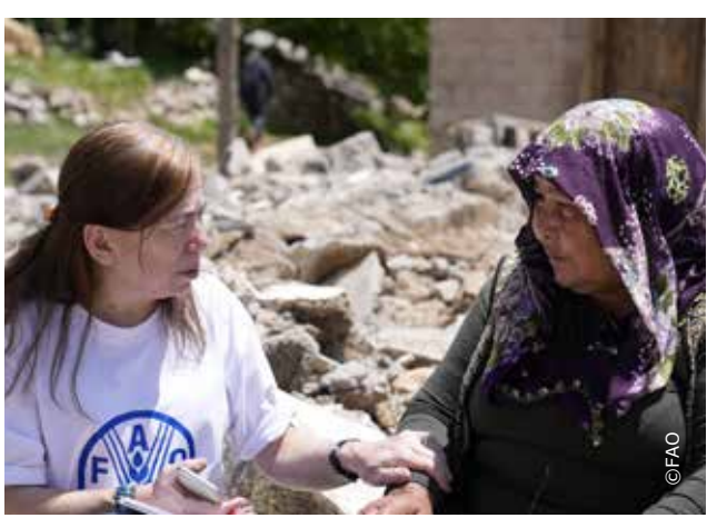
The ERRP provides assistance to victims of the February earthquakes in Türkiye

These initiatives align with comprehensive strategies recommended in the Agriculture Sector Needs Assessment for Earthquake-Impacted Provinces, highlighting the necessity of support in the form of inputs, reconstruction, and inclusive recovery for a sustainable agricultural sector. In addition to these interventions, the sustainable recovery of 885 smallholders is supported through the enhancement of technical skills, encompassing climatesmart agriculture and best practices in agriculture, facilitated through Farmer Field Schools.