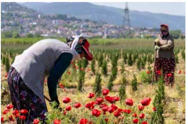
The study's findings indicated that the project achieved its targets

Data from the report clearly illustrate the project's profound impact on local labour dynamics and the effectiveness of focused efforts to enhance economic and social welfare in the communities it serves. Additionally, the report noted a marked improvement in vocational skills among beneficiaries, particularly in the agricultural sector, signalling a shift towards more sustainable and resilient livelihoods. Overall, the findings demonstrate that the project helped to empower communities and promote agriculture as a viable and fulfilling occupation.