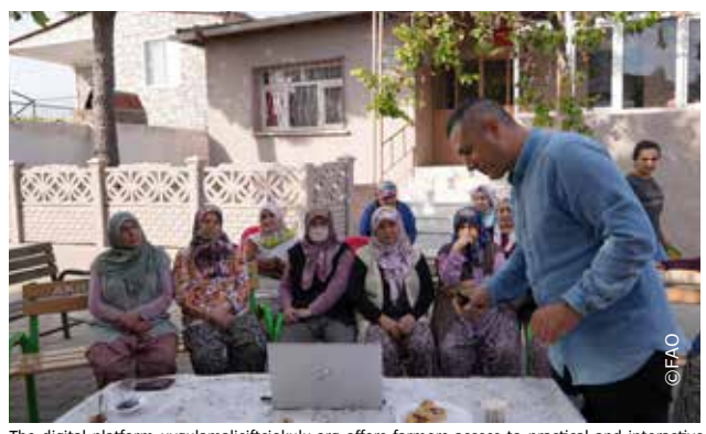
The digital platform uygulamaliciftciokulu.org offers farmers access to practical and interactive educational resources.

FAO-Türkiye is dedicated to providing farmers with modern agricultural techniques that increase productivity and ease the transition to sustainable farming. The digital platform plays a key role in preparing farmers for the agricultural challenges of the future. In support of this initiative, comprehensive field visits have been conducted in ten provinces. These visits are critical for acquainting farmers with the platform's features, ensuring they can effectively utilize these digital tools to advance their farming practices.