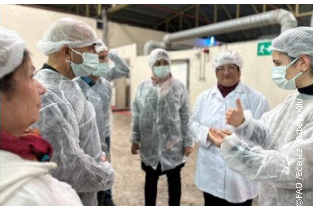
Participants visiting fig storage and processing facilities of Tariş Cooperative

Türkiye recently launched the One Country One Priority Product (OCOP) initiative in cooperation with FAO, designating figs as a special agricultural product. The national launch event, held on 7-8 December 2023 in Aydın, Türkiye, featured the participation of various stakeholders, including government officials, members of academia and industry representatives. Keynote presentations outlined the global progress of OCOP, with a focus on fig development in Türkiye. The event emphasized strategic collaboration to strengthen the fig sector and included practical discussions on exporting processed fig products. The success of the launch signifies a transformative step in Türkiye's commitment to sustainable agrifood systems. Participants also visited the Fig Research Institute and fig-drying facilities, gaining insights into industry best practices. OCOP aims to promote inclusive and sustainable food systems by developing Special Agricultural Products and addressing gaps in the value chain.