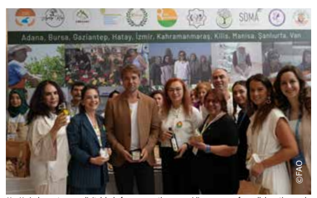
HepYerinden acts as a digital hub for cooperatives, providing a space for collaboration and a unified identity.

Stories of resilience from cooperatives that overcame impacts of the February earthquakes have demonstrated the transformative potential of HepYerinden. The platform is not just a marketplace; it functions as a symbol of collective strength and a tool for sustainable development in Türkiye's agricultural sector.