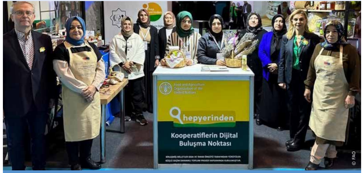
Hepyerinden.koop, an FAO-supported digital marketing network comprising 10 women's cooperatives from across Türkiye, attracted great interest at the 5th Türkiye Cooperatives Fair.