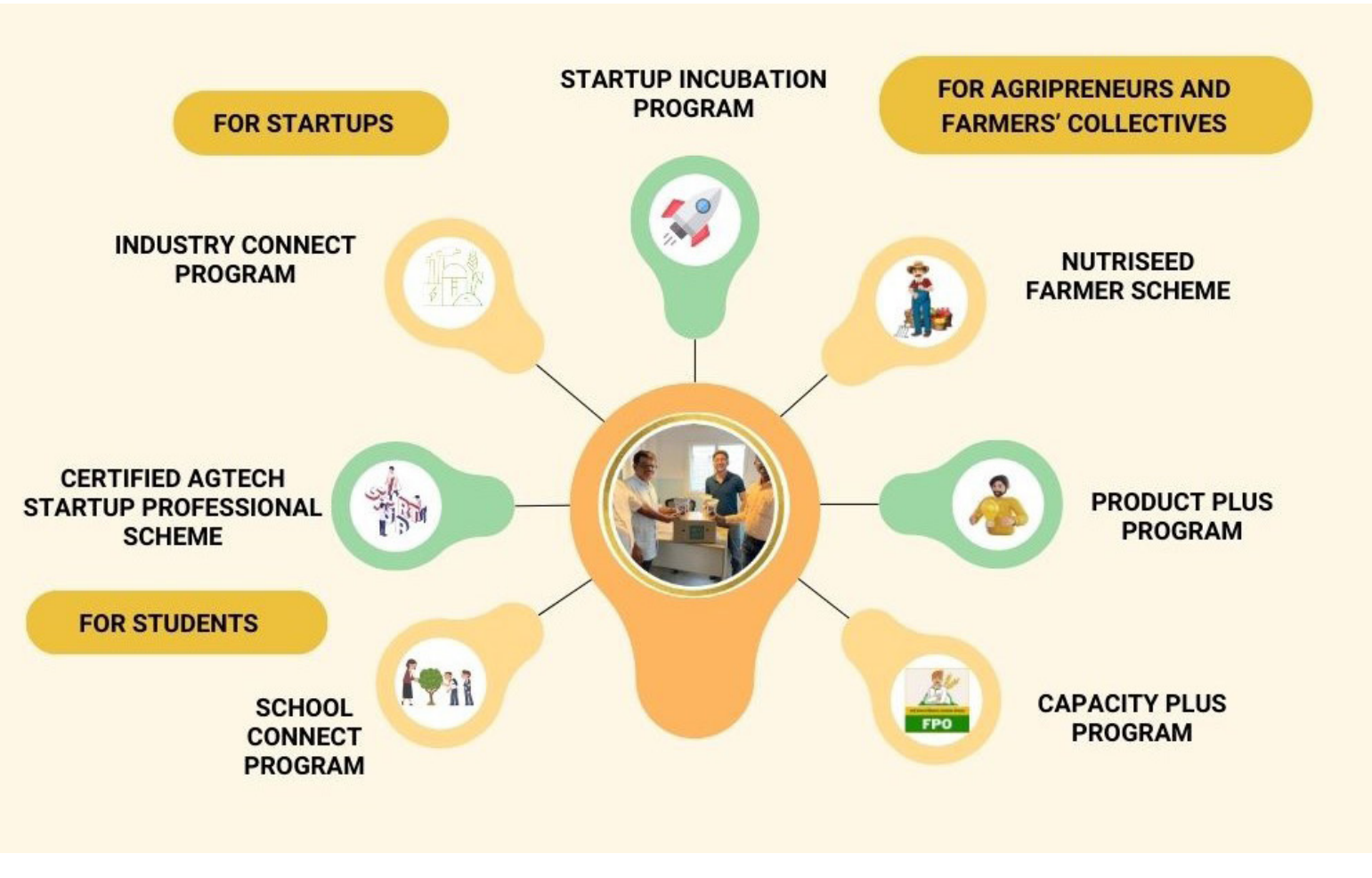
Incubation programs implemented through SICs

The SIC concept assumes that value chain problems can be addressed by creating entrepreneurships involving various stakeholders such as startups, agripreneurs, SHGs, FPOs, and students. Currently, seven major incubation programs are being implemented through ICAR-CTCRI-ABI, Thiruvananthapuram, and its SICs to address value chain issues.