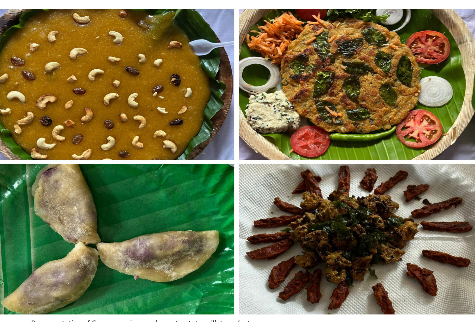
Documentation of Cassava recipes and sweet potato-millet products

varieties, rice, millets, wheat, vegetables, and other nutritionally enhanced crops, for combating malnutrition. From each Nutriseed village, the SICs selected ten Nutriseed farmers for the incubation program. The SIC will supply the seed/ planting materials produced at their Central Seed Production facility, 'freeof-cost', to the Nutriseed farmers and arrange 'buy back' by linking them with incubated startups of ICAR-CTCRI-ABI and its SICs. The Nutriseed Village scheme focusing on biofortified sweet potato is implemented in all SICs, and 56 farmers are enrolled (Box 4). During 2022-23, the Nutriseed villages created USD 1204 revenue for Nutriseed farmers, created three jobs, and also generated 760 labor person days.