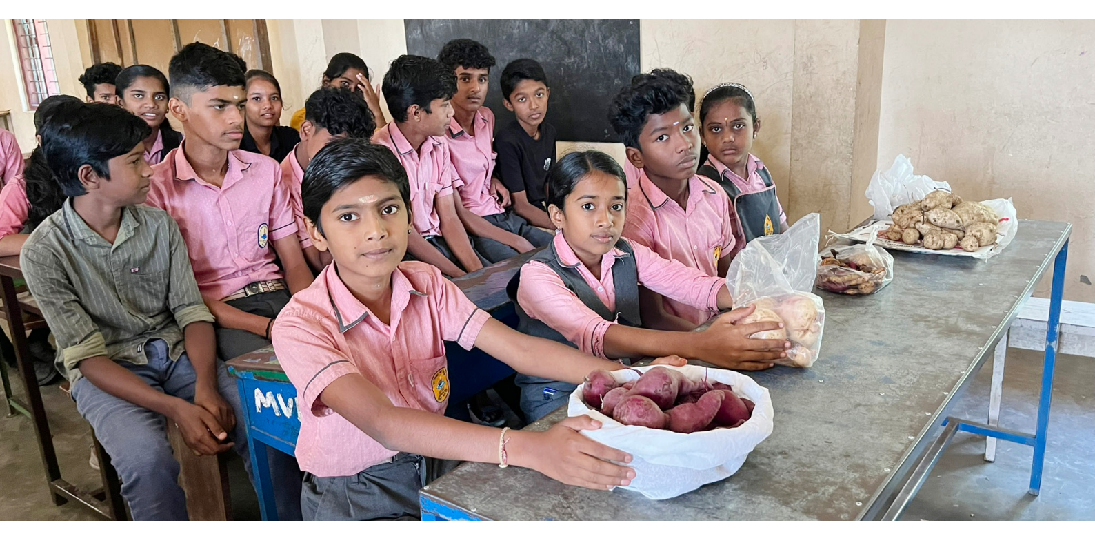
The 3M-SP students of Attapadi, Kerala with their homegrown produce