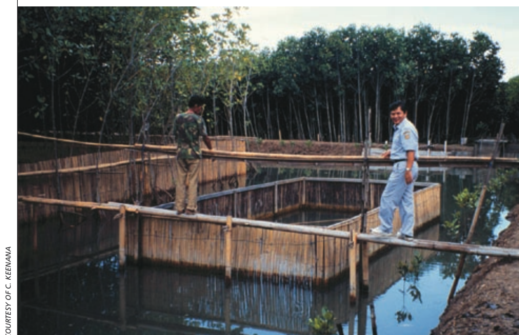
FIGURE 5 Mud crab fattening pen in Indonesia