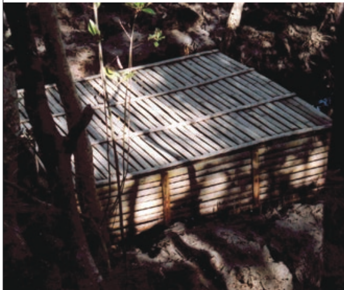
FIGURE 3 Mud crab fattening bamboo box in the Philippines

The statistics for aquaculture production of the mud crab ( S. serrata ) in Tables 2 and 3 indicate that in recent years Chinese production of mud crabs is approximately an order of magnitude greater than that of the next highest producing country