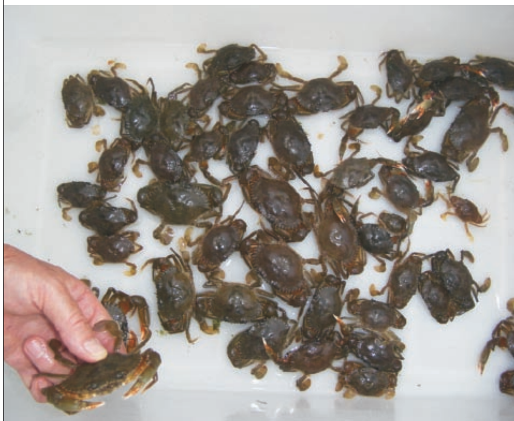
FIGURE 6 Hatchery-produced mud crab juveniles