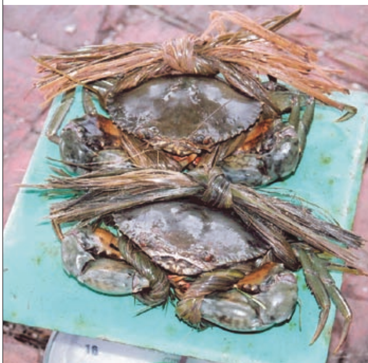
FIGURE 2 Live crabs on sale in Viet Nam

There are a number of problems encountered by collectors and farmers, involved with using wild harvested crabs in various farming systems. Stock will often consist of a wide variety of sizes, and as mud crabs have a tendency to cannibalism, larger specimens will often predate on smaller crabs, causing significant mortalities amongst farm stock.