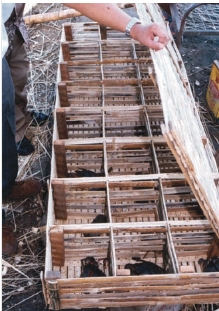
FIGURE 4 Mud crab individual fattening bamboo boxes in the Philippines