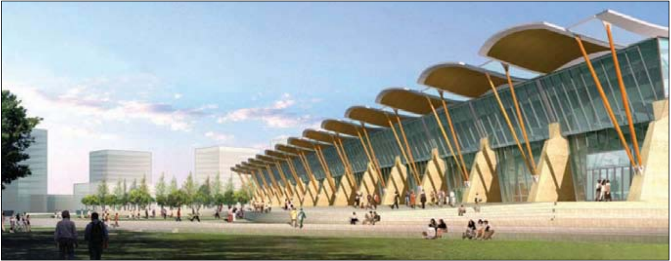
CITY OF RICHMOND, BC, CANADA

British Columbia is pushing to use wood in construction – the 2.6 ha roof of the 2010 Olympic Speed Skating Oval for the 2010 Winter Olympic Games near Vancouver is constructed mainly of wood from beetle-killed trees