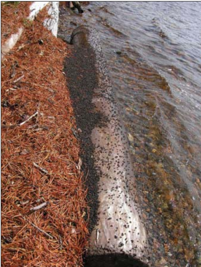
Mountain pine beetles washed up on a lakeshore give an idea of the severity of the outbreak