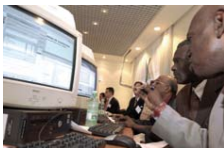
Statisticians learn how to use a FAO database at a training workshop.

Distance and computer-based learning is replacing the older face-to-face formats such as courses, workshops, and learning by doing. Specifically designed learning resource materials are made available through FAO's capacity building portal ( www.fao.org/capacitybuilding ). Fellowship and scholarship programmes are managed with collaborating governments and institutions, with FAO playing a facilitative role. For example, a scholarship programme established together with the Hungarian Ministry of Agriculture will benefit 100 students from a range of countries over a period of five years, offering masters degrees in various agricultural disciplines.