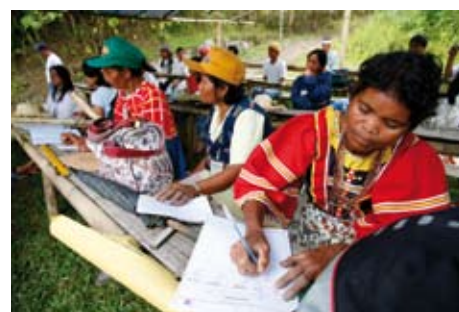
Villagers attend farmer training in Mindanao, Philippines.