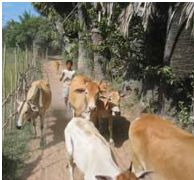
Child herding cattle in Cambodia

Van den Berge (2009) looked at child labour (largely herding) in the rural communities of Ccasacunca and Cusibamba in Peru . What is interesting in this region, is that girls rather than boys are most involved with herding. Young children of both sexes from the age of 5 years (practically all children under the age of 12) of both sexes herd (cows, bulls, sheep, goats, llamas, alpacas and vicuñas), but in adolescence (14–18 years for the purposes of this study), the majority of herders are girls out of school (often because of the long distance to school). At around 12 years of age, boys in these rural Peruvian communities either head towards villages in search of employment or increase their activities on the land, while girls tend to stay close to the home and perform domestic and