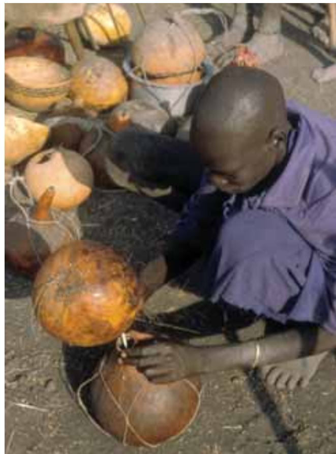
A member of the Dinka ethnic group transferring milk from a milking calabash to a storage calabash