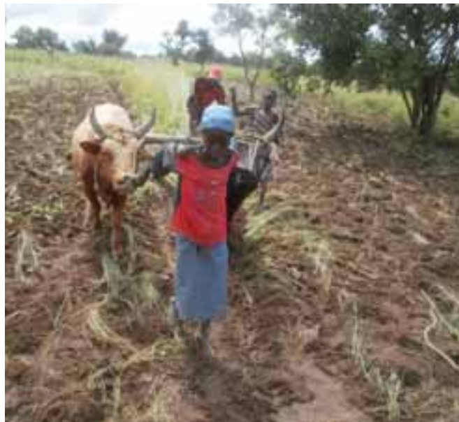
Girl guiding oxen in Mali

injury, for example, being trampled by hooves, goring and chest pains. It could generally be said that using oxen for ploughing reduces labour demand and that it is therefore a labour-saving technology. This may be true. However, it is not always a child-labour-free technology, and special attention must be paid to the implications of labour-saving technologies for the situation of children.