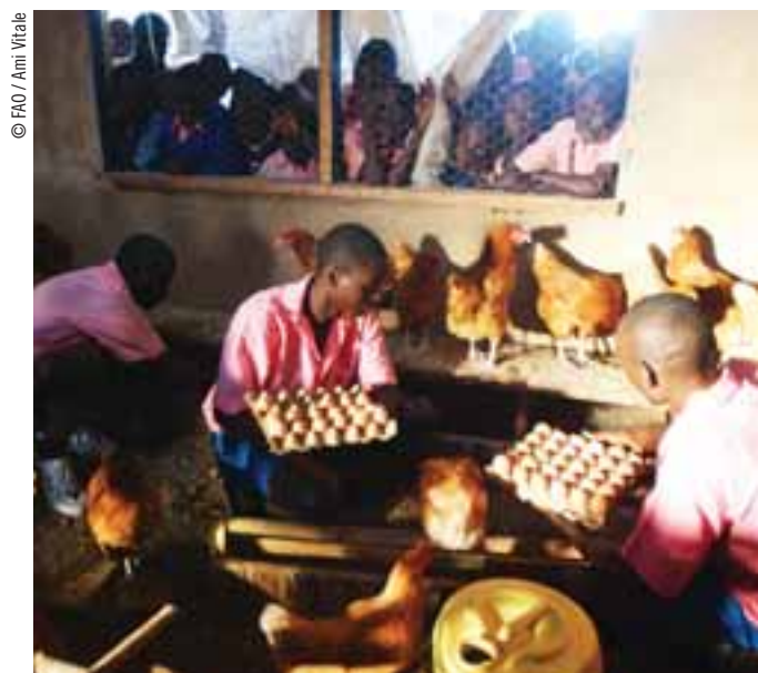
Children collecting eggs from a chicken coop set up in their school

In the livestock sector, time-consuming activities such as herding and factors such as migration introduce further challenges to education or to combining education with work. Other less time-consuming forms of livestock care which do not involve travelling long distances or frequent migration may be more easily combined with schooling. The literature reviewed in this study discusses a number of barriers to education for children, in particular in pastoralist communities. However, a number of the factors (discussed in Box 1), especially with regard to perceptions of formal schooling, may very well also apply to children involved in the livestock sector in non-pastoral rural communities.