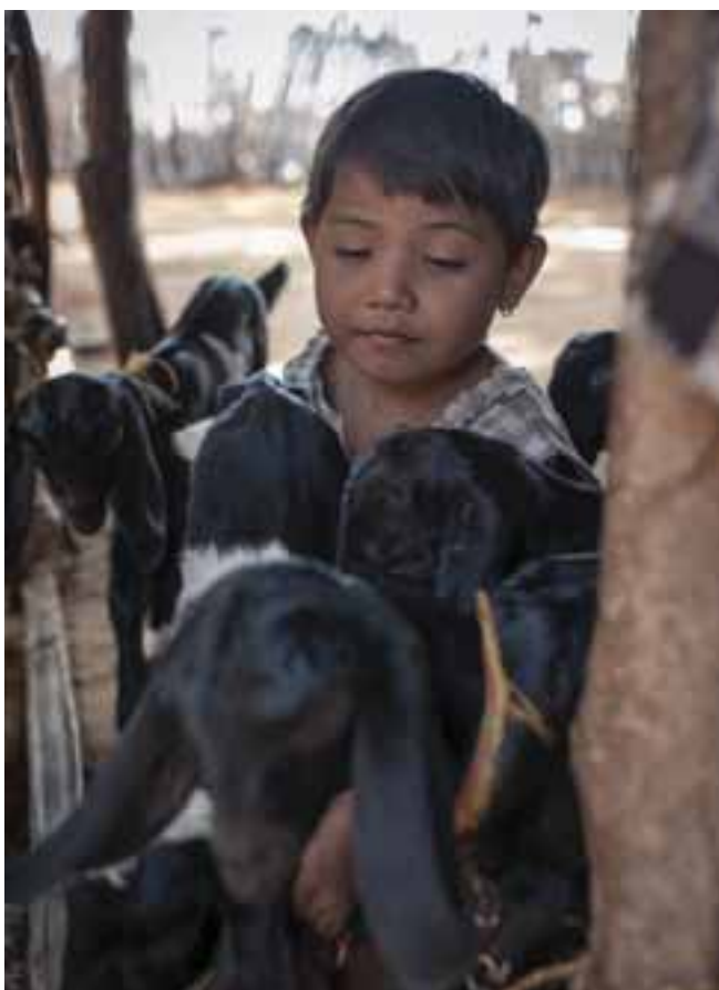
Boy with goats in Myanmar