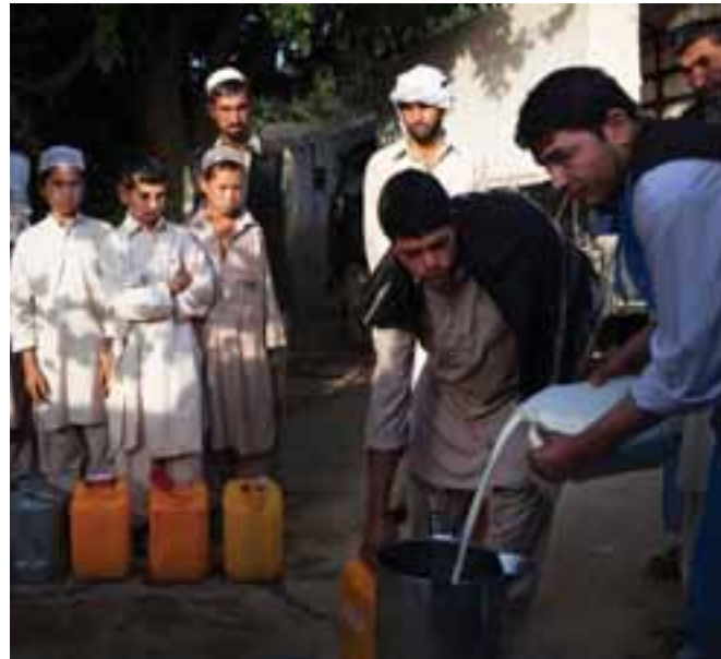
Integrated dairy scheme in Afghanistan

In the rural north central region of Viet Nam, Save the Children data from 1997 provide several starting ages for work in certain occupations related to livestock (Edmonds, 2003). Collecting pig feed, digging up worms for ducks and feeding chickens started at the age of five. Cooking food for pigs and feeding them began at the age of six. Tending cows and buffaloes, collecting grass, fetching water and collecting cattle manure started at the age of nine. While the data are not recent, they give an idea of livestock activities in which children have been involved and probably continue to be so today in some locations.