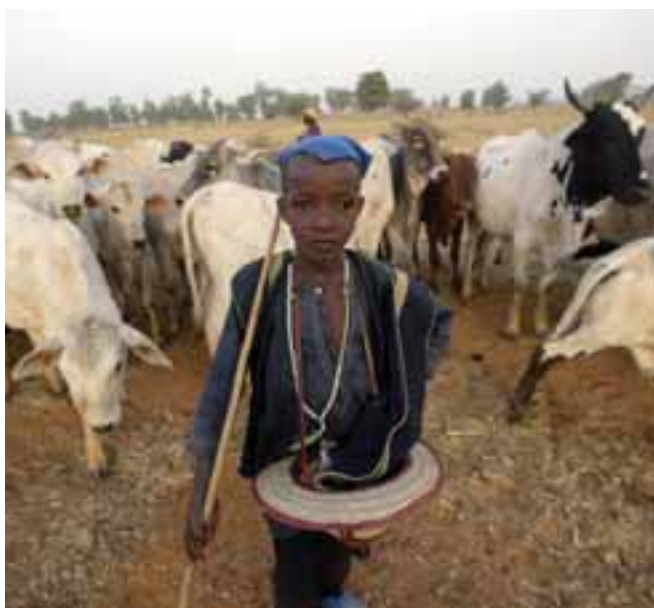
A young Fulani boy tending a herd of oxen