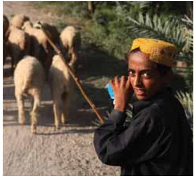
A young boy herding sheep