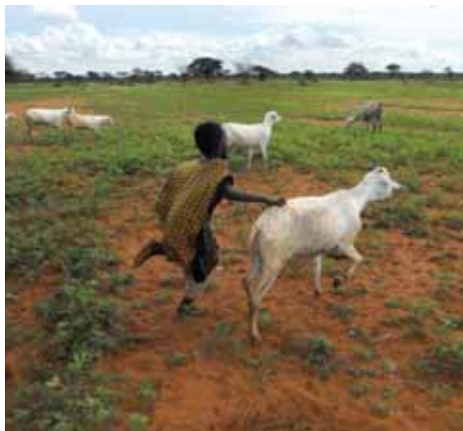
A child running with a herd of goats out grazing

The introduction of internationally defined norms (on child labour and hazardous activities for children) must take care to respect cultural norms, traditions and desires. Analysis of hazards and risks needs to be conducted together with pastoralists in order to build a common understanding of what tasks have a negative impact and which tasks are appropriate for a child. It is extremely useful to find out what pastoralists themselves find important,