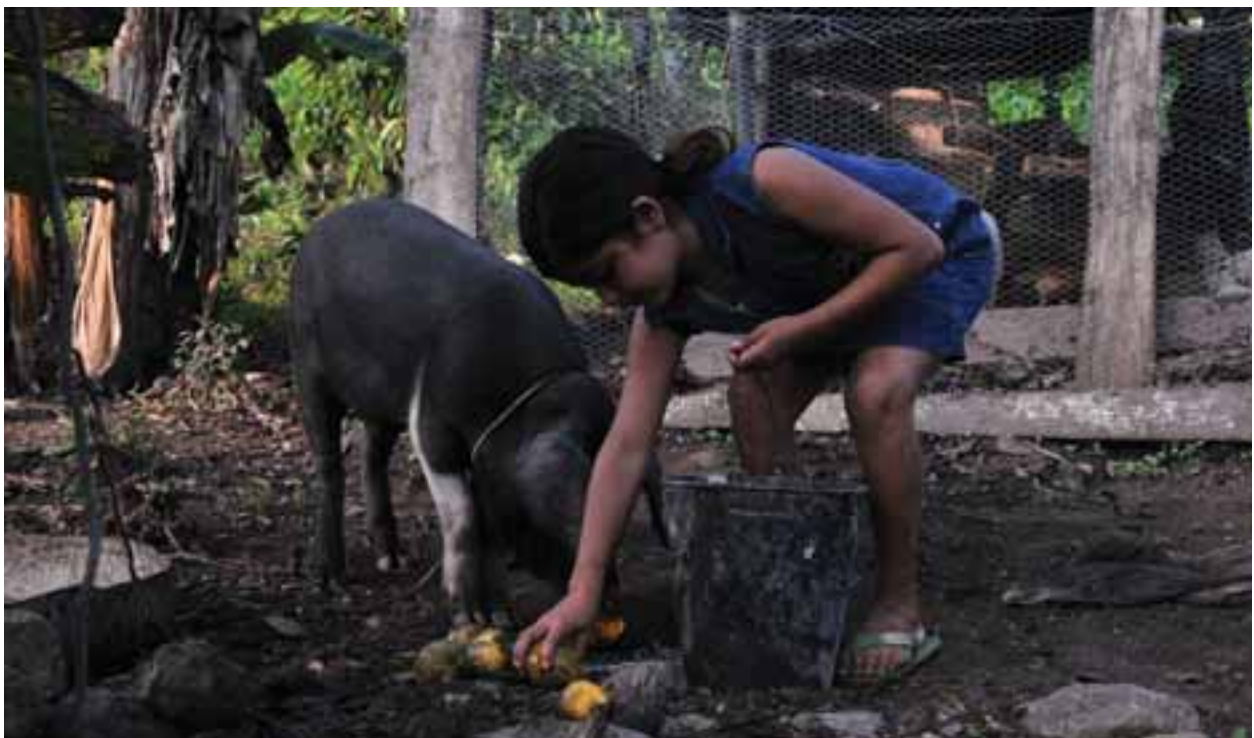
A young girl feeding the pigs on a family farm

There is a need to learn more about the situation of girls' and boys' involvement in the livestock sector.