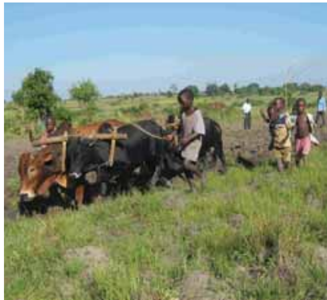
Children ploughing in Eastern Uganda