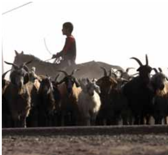
A boy herding goats on horseback

are also able to attend school. Half of the 2.8 million 7–14 year olds in Morocco are involved in household chores for over 4 hours each day. If the definition of work included household chores, girls' involvement in work would be significantly larger than that of boys. Of the children involved with household chores for over 4 hours a day, 68 percent are full-time students (this is more often the case for boys than for girls), while 22 percent neither work nor attend school (this is more often the case for girls than for boys).