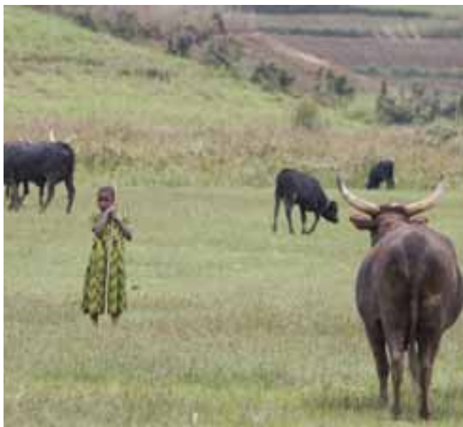
A child herding cattle for grazing