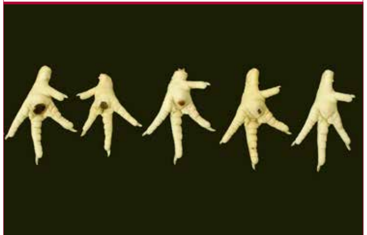
Varying severity of footpad dermatitis in broiler chickens

There are a number of problems associated with poultry metabolism, and they often have a genetic cause. The major issues result from a very high metabolic rate, efficient feed conversion and rapid growth. Rapid growth places pressure on poultry's internal organs. This can lead to cardiovascular diseases, the most prevalent of which are ascites and sudden death syndrome. Ascites is the accumulation of fluid in the lungs and abdomen caused by