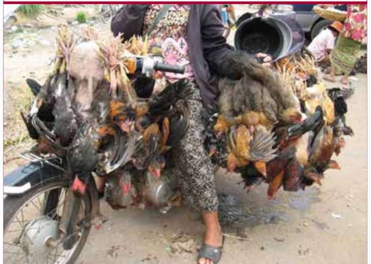
Highly stressful transport of chickens

In large abattoirs, poultry arrive on lorries and are often kept in a lairage (holding area) before being killed. In extreme climates, this can be very stressful as birds are densely stocked and unable to cool themselves. Many birds may die before reaching the slaughter line, often through heat stress. Not only is this bad for