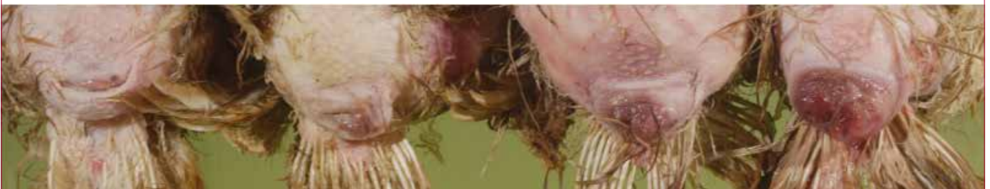
Varying severity of vent damage in laying hens

Several sources provide advice on avoiding welfare problems in layers. These include national government codes of practice, such