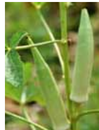
Figure 5: From top to bottom and left to right; Pigeon pea ( Cajanus cajan ), Yam ( Dioscorea sp.), Taro ( Colocasia esculenta ), Groundnut ( Arachis hypogaea ), Soya bean ( Glycine max ), Cowpea ( Vigna unguiculata ) and Okra ( Abelmoschus esculentus )