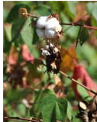
Figure 8: Common cash crops in southern Africa. Left to right: Tobacco ( Nicotiana tabacum ), Cocoa ( Theobroma cacao ) and cotton ( Gossypium sp.)