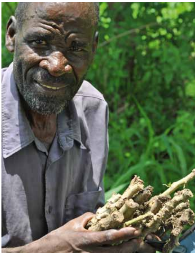
Figure 3: Farmer with cassava cuttings used for planting

The conservation and management of plant genetic resources in the form of traditional as well as modern varieties and their availability to and use in agricultural production systems is the axis of food production.