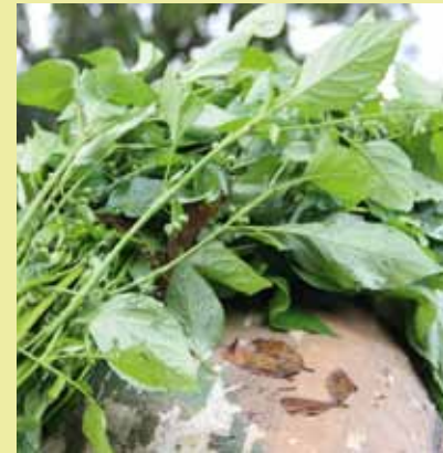
Figure 7: Some edible plants collected from the wild in Southern Africa. Left, wild grass ( Gramineae ) named 'Lole' in South Malawi and eaten in the lean period; centre, edible fruits of Cattley guava ( Psidium cattleianum ), an invasive bush in Madagascar and Comoros; and right, unidentified leafy wild plant.