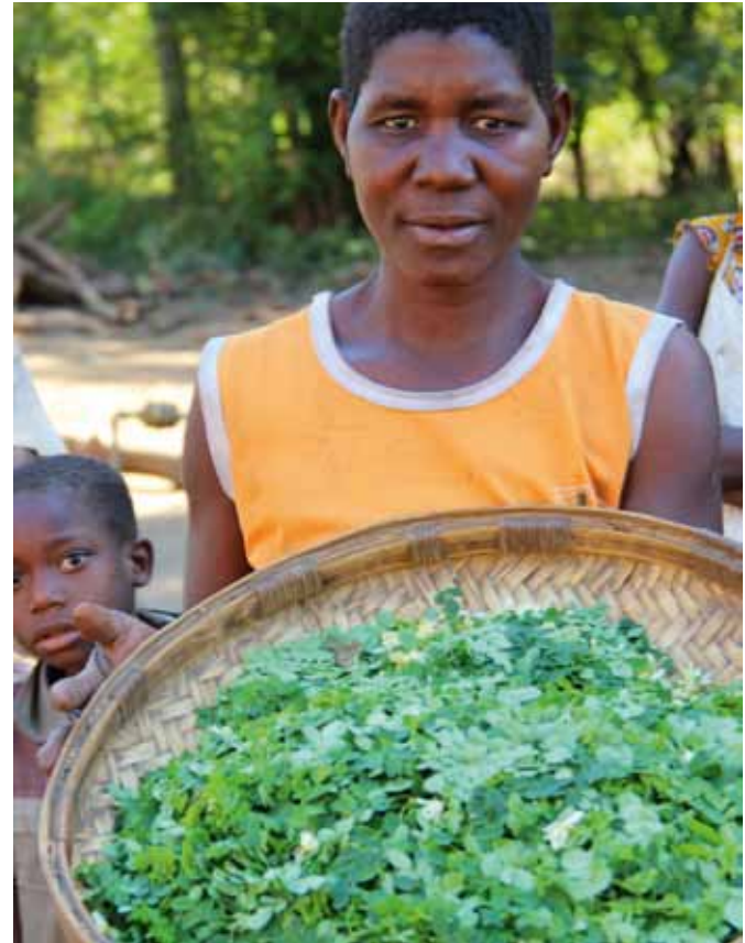
Figure 1: Harvest of Moringa leaves ( Moringa oleifera ) for household consumption

Crop diversity (PGRFA) refers to crops and varieties that farmers cultivate and use as part of their subsistence. They consist of local farmers' varieties (landraces), modern varieties of traditional crops bred by commercial seed companies, introduced crops (like maize and cassava), as well as the crop wild relatives, weedy forms of crops and wild species used by communities for food and agriculture.