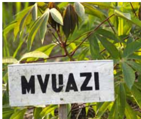
Figure 6: Different varieties of Cassava ( Manihot esculenta )