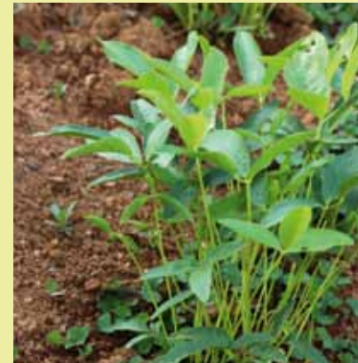
Figure 2: Some examples of underutilized species in Southern Africa. Left, Sesame seedlings ( Sesamum indicum ); centre, Paracress ( Acmella oleracea ); and right, Bambara nut ( Vigna subterranea )