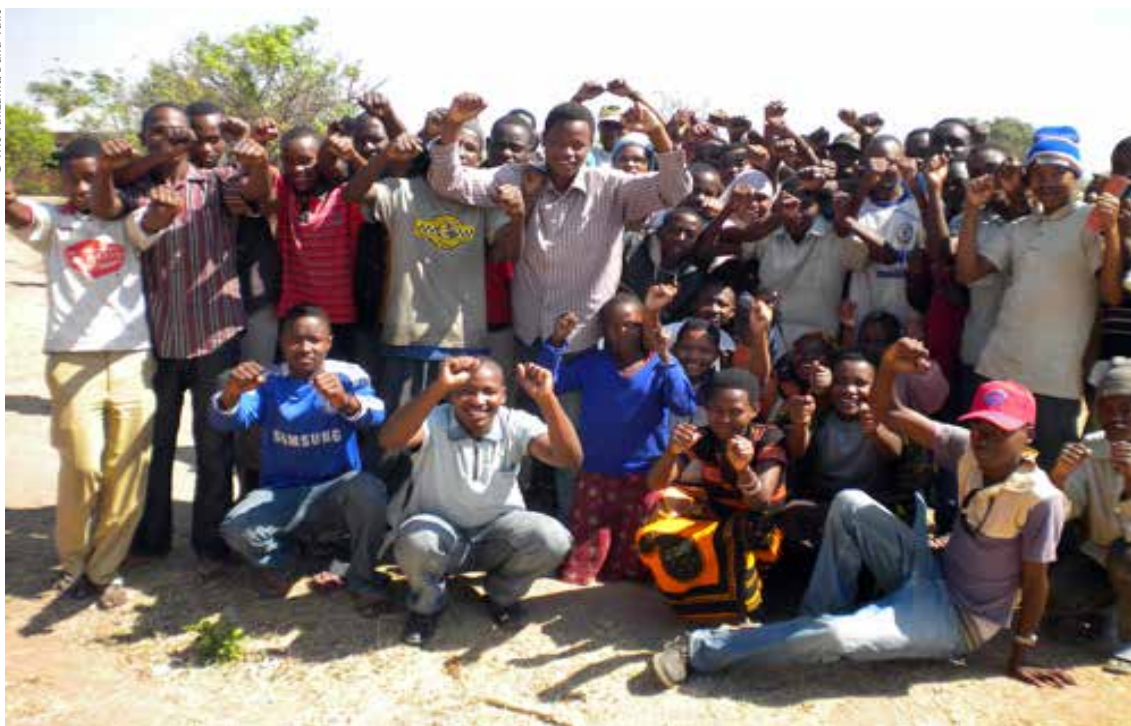
Singida Youth Producers Union

Young producers should be put at the centerpiece of a “pro-poor” agricultural growth agenda. Empowered through existing producers’ organizations networks and made more competitive by both institutional and technological innovations, they can become greater market participants, both domestically and globally. As assessed in Malawi, Tanzania Mainland and Zanzibar, facilitating young people’s access to agricultural markets is possible.