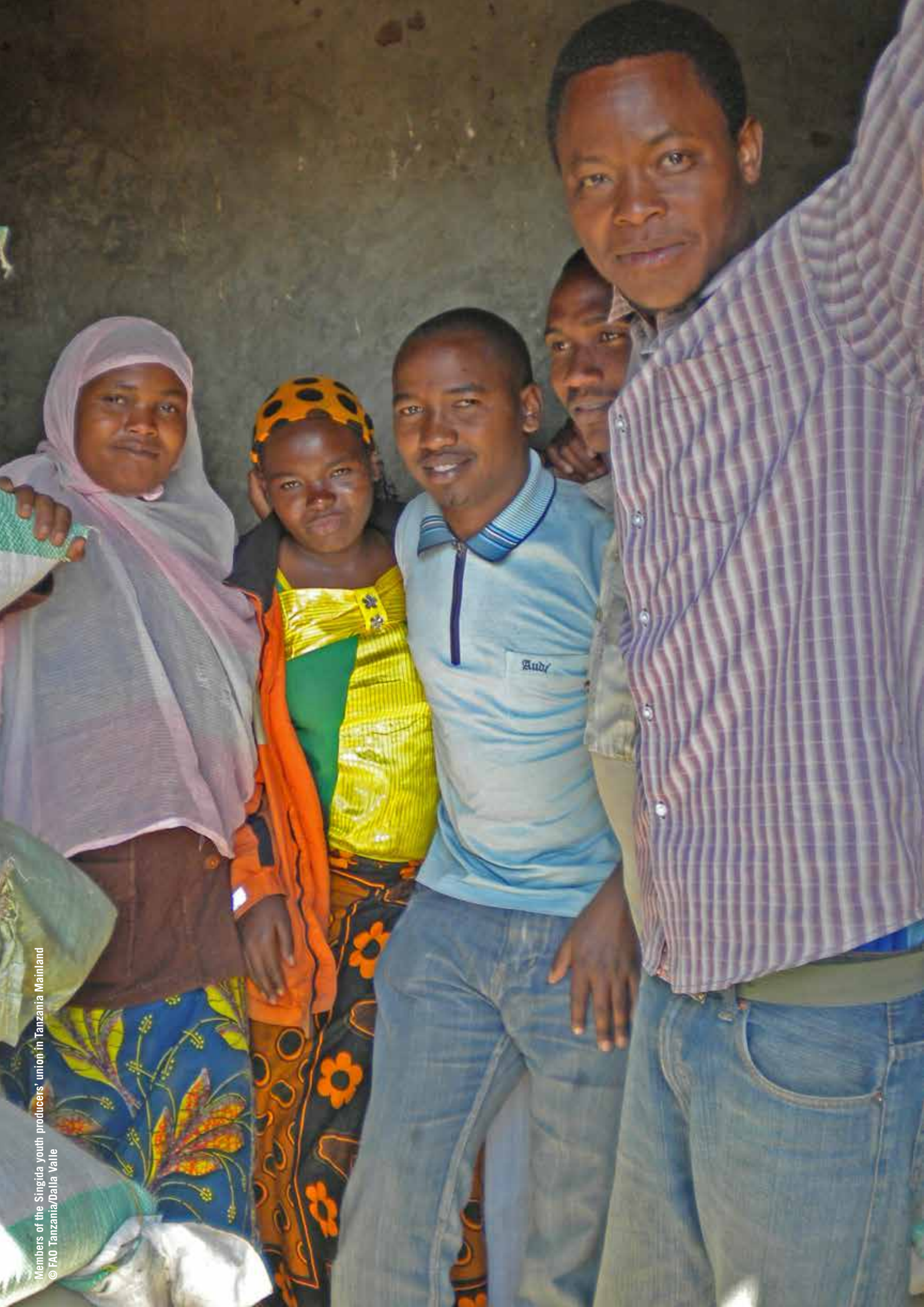
Members of the Singida youth producers' union in Tanzania Mainland