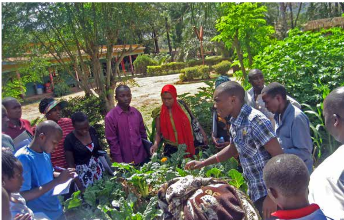
Agricultural skills lesson in Tanzania Mainland

Unemployment is therefore becoming a top concern, with nearly 2.4 million unemployed people in Tanzania Mainland and Zanzibar – most of them young. 27 The youth unemployment rate in Tanzania Mainland is 17 percent (compared with a general unemployment rate of 12.9 percent), and is estimated to be 20 percent in Zanzibar archipelago. 28 Indeed, the situation of the youth population is critical in terms of unemployment.