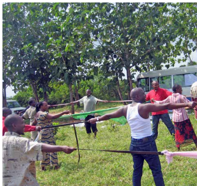
Training of facilitators in Tanzania Mainland

The parties involved in the partnership agreed to formalize the joint activities through Memorandums of Understanding (MoUs) in order to further the