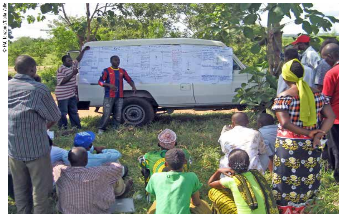
Training of facilitators in Tanzania Mainland