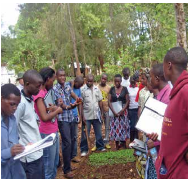
Agricultural skills lesson in Tanzania Mainland