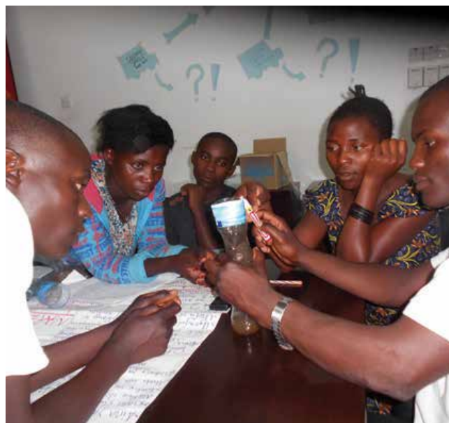
Soil and water lesson in Tanzania Mainland

In Tanzania , the activities are supporting the Tanzania Agriculture and Food Security Investment Plan (TAFSIP), which addresses the core national problems of poverty and food insecurity in rural areas, and on how to promote agricultural growth and food and nutrition security in both Tanzania Mainland and Zanzibar