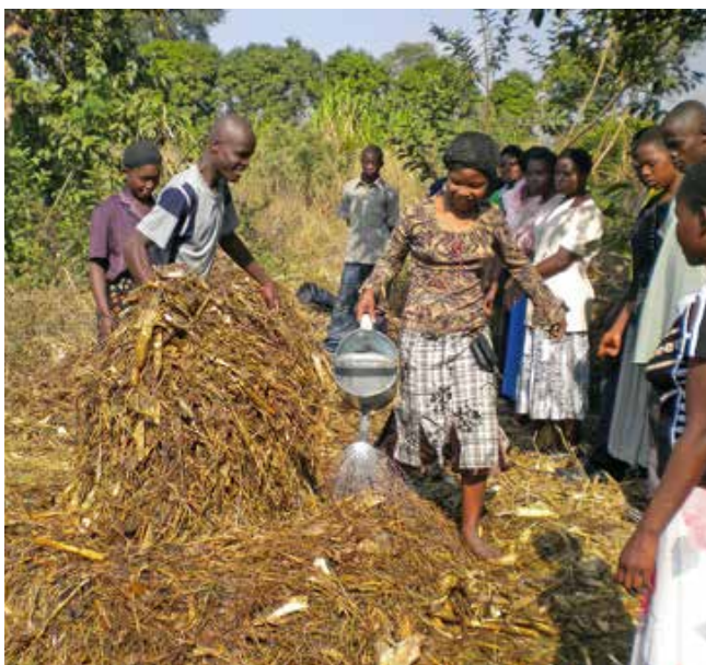
Compost training in Malawi

a person who works at least one hour per week is officially classified as employed. Therefore, the figures do not capture the real situation. Underemployment is prevalent, especially in the agricultural sector, which accounts for 80 percent of the labour force. Working poverty is high due to low wages; the minimum wage is less than USD 1 per day. The unemployment problem is also compounded by poor data, the absence of an up to date youth policy, a lack of coherent government action and weak institutional capacity for skills development. Furthermore, the economy is failing to produce enough jobs for a fast growing population, particularly given its low manufacturing base and generally low-skilled labour force.