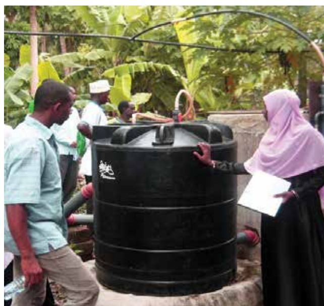
Agro processing lesson in Tanzania Mainland

In both countries, the demand for higher value and processed foods, as well as the rise of supermarkets and international chains, have implications for the entire food marketing system. This is because they alter procurement systems and introduce new quality and safety standards which are difficult to meet for young small producers.