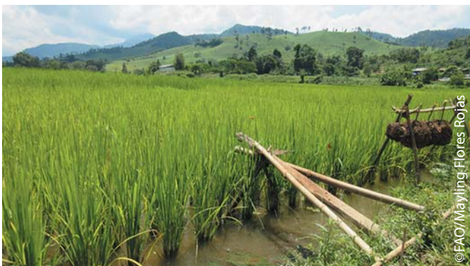
A rice-fish field drum seeded