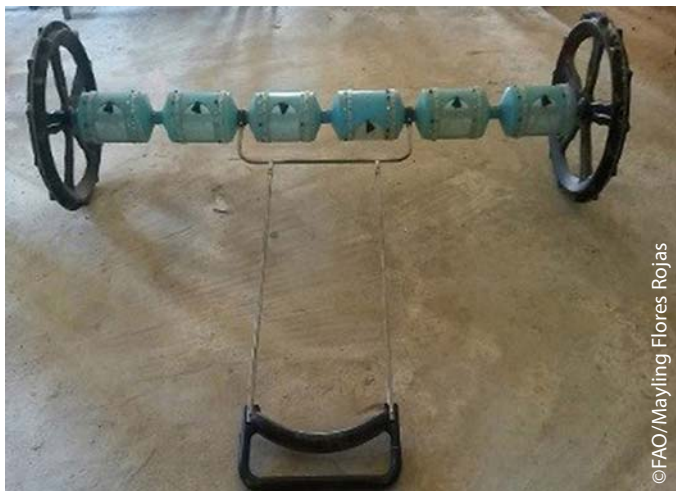
The 12-row drum seeder used by farmers in Sayabouly province