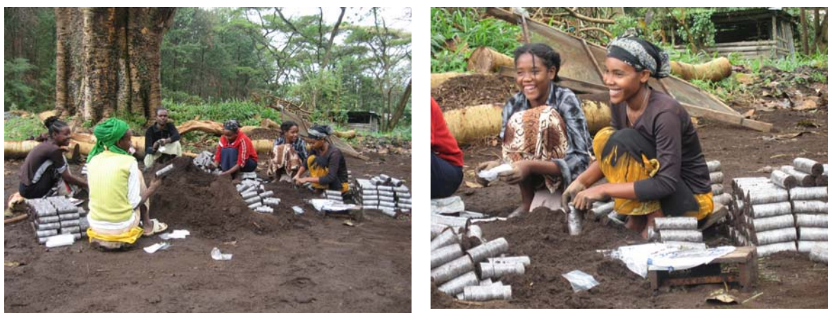
Plate 4: Women actively participating in pot filling in WGCF forest nursery

Labour-intensive forest enterprises as Tiro-Botor Bacho state forest project, Munesa Shasemene Forest Enterprise, and Finfine Forest Development, Marketing Enterprise (FFDME) and WGCF employ thousands of people following the seasonal agricultural cycle.