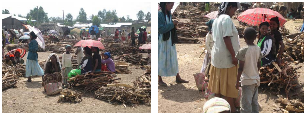
Plate 3: Women selling fuel wood in Shashemene market

The above case studies clearly confirmed that although it is not documented and recognized, the rural women contribute a high annual income to improve the livelihood of the household in particular and the community in general from fuelwood and other minor forest products. For example, some of the minor forest products such as gum and incense (also mainly collected by female and children) contribute about half of the officially trade volume of the major share for rural household economy. They also play a significant role in improving the livelihood of the households and the communities in the northern and southern woodlands of Ethiopia. As described in the Forestry Society of Ethiopia (2002) in Amhara, Oromia and Somali Regions, the cleaning and grading process of gum are carried out by women, the 1999 harvest amounted to 7,000 metric ton and nearly 3 million Birr / 357,142 US dollar were paid to harvesters and cleaners. However, the role of forest products in the rural community and the gender role of the products are poorly documented (Markos 1998).