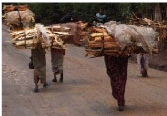
Plate 1: Women carrying fuel wood for household consumption