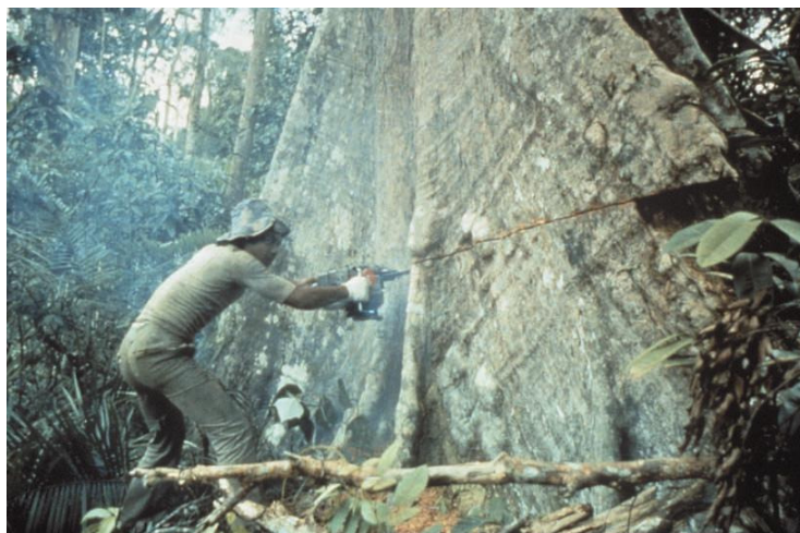
Figure 1. Conventional harvesting systems do not utilize the best harvesting practices.

The objective of the study is to present a method, applied in eastern Pará state since 1996, to assess degradation caused by logging based on the impact over future crop trees, ground area impacted by logging and timber wasted in harvesting activities.