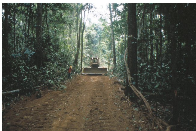
Figure 3. Minimizing the width of forest roads reduces costs and decreases ecological damage.

The method could be disseminated and discussed with other FM centers, training centers, universities and forestry foment organizations and agencies in a way to improve its operational procedures, disseminating the method to other tropical regions, and generating parameters to permit comparisons over large extents of forestry operations.