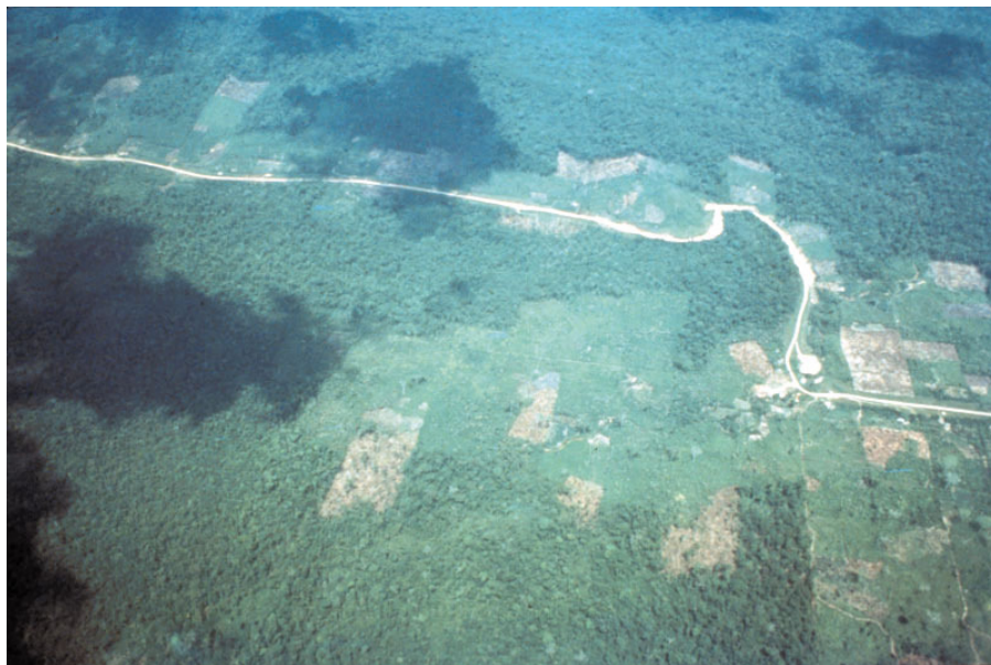
Figure 2. Roads cause land use changes by providing market access for agricultural and forestry products.

The conventional logging operation was conducted by a logger used to operating in the study region. His methods included the use of a harvesting crew with on-the-job-training, but no specific training in RIL methods. The CL operator used a crawler tractor (Caterpillar D6 Logger) with winch for constructing roads, log decks, and for skidding operations. A “tree hunter” ( mateiro ) worked with the sawyer to locate merchantable trees which would then be felled, without the use of directional felling techniques. Sawyers were paid on a piece rate, which typically encouraged rapid felling with little regard for waste and impacts on the residual stand. Skidding crews were not provided with precise information from felling crews regarding location of felled trees and therefore needed to search for logs. Logs were sorted and loaded using a Caterpillar 938F Loader.