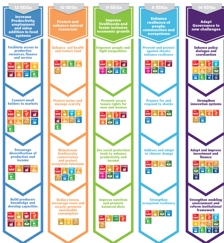
Figure 2: A representation of programme portfolios linked to SDGs, as proposed by the 20 interconnected actions formulated by FAO