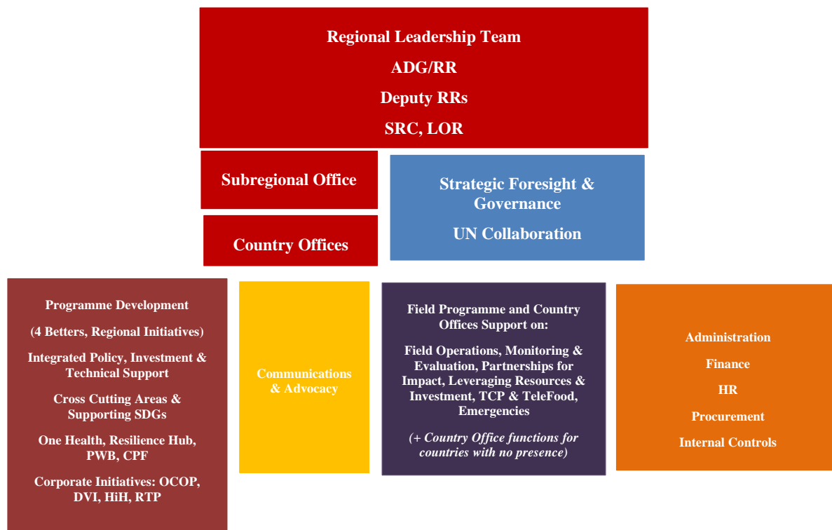
Figure 2. FAO Regional Office for Europe and Central Asia (REU) – Transformed structure 12

5. The revised set-up was designed with built-in flexibility to adapt its main features to the specificity of each region. The implemented, transformed structures of the Regional Office for Europe and Central Asia (REU) and Subregional Office for Central Asia, integrating some region-specific features, is provided in Figures 2 and 3 below.