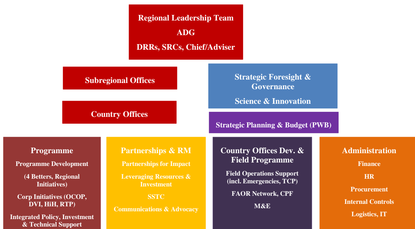
Figure 1: Regional Offices - Global Common Functional Organigramme 11