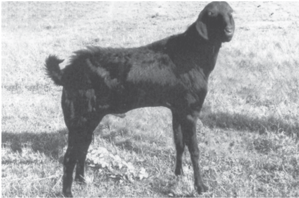
Figure 3. Adult male of Attappady black goat.

The length of oestrus cycle of Attappady Black goat does was 20.5 \pm 0.2 days and the overall duration of oestrus was recorded as 39.8 \pm 0.7 hours. The overall average of litter sizes from first parity to sixth parity was 1.3 \pm 0.02 . The incidence of singles was greater (73%) and the rate of twinning was 26%. The incidence of triplets (0.8%) and quadruplets (0.1%) was low. The incidences of multiple births was 11%, 36%, 47%, 47% and 36% in the first, second, third, fourth and fifth kidding, respectively.