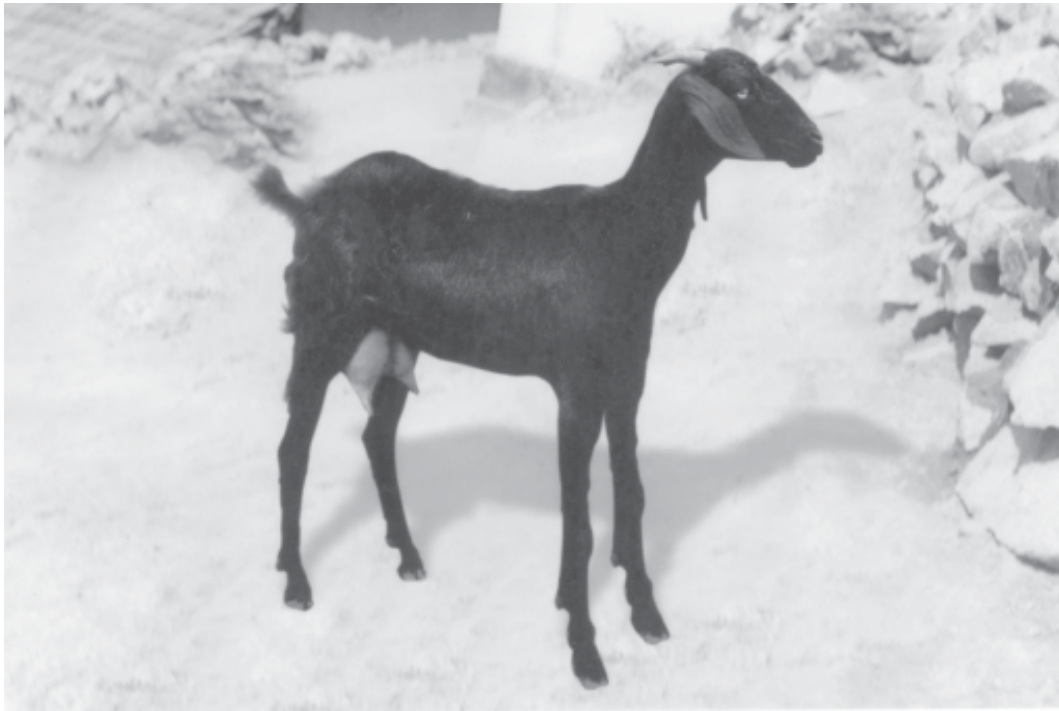
Figure 2. Adult female of Attappady black goat.

The colour of animals is black. Rarely white spots were noticed on the forehead. The skin was either light black or grey. Tassels/wattles were noticed in some of the goats. In most of the adult goats horns were present and they were curved laterally upwards and backwards. Ears were medium length (13.5 cm), drooping over the lateral side of the face. The hair was glossy and straight. The tail was of a curved bunchy type.