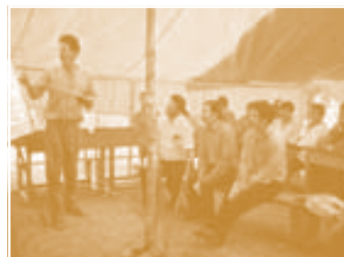
Top: Watershed planning meeting in Gorkha district, Nepal