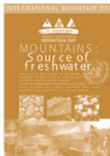
Above: Poster for the first International Mountain Day, 11 December 2003

Watershed management experts have recently recommended that water supply should be the central point at which different sectors — such as agriculture, irrigation and forestry — should converge. Several national governments are now reviewing their policies according to a watershed management perspective.