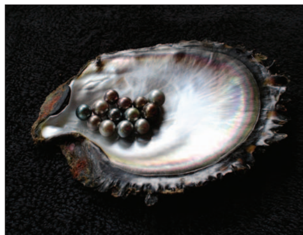
Cultured “black” pearls produced from Pinctada margaritifera in Kiribati, central Pacific. The pearls are held in a P. margaritifera shell.

There is considerable taxonomic confusion about the Akoya pearl oyster which at this stage is probably best considered as an unresolved species complex encompassing Pinctada fucata , P. imbricata , P. martensii and P. radiata . Members of this complex have a wide distribution from the Mediterranean Sea, through the Red Sea and Indian Ocean, including the Persian Gulf, into the Pacific Ocean and throughout southeast Asia and northern Australia. It also occurs in the Caribbean Sea.