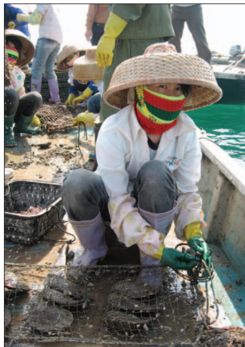
Young women clean pearl oysters and culture equipment from boats in Li'an Bay, Hainan Island, China.

Akoya pearl culture has also been investigated on the Atlantic coast of South America (Urban, 2000; Lodeiros et al. , 2002), in Australia (O'Connor et al. , 2003), Korea (Choi and Chang, 2003) and in the Arabian Gulf (Behzadi, Parivak and Roustaian, 1997). However, information on commercial production of cultured pearls from these regions is not yet available.