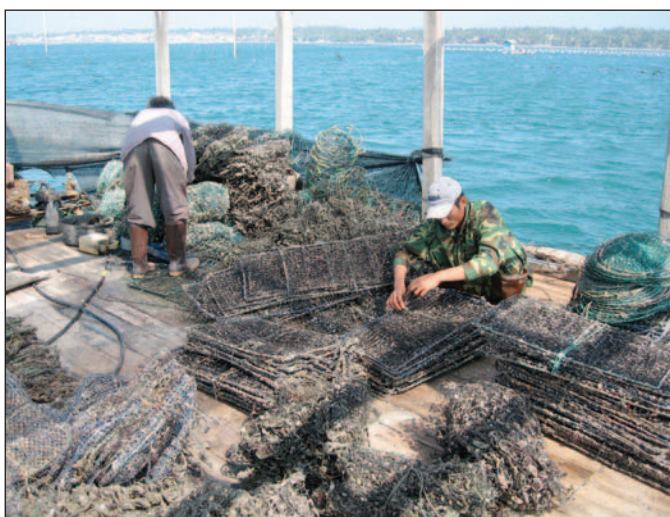
Pearl farm workers clean and sort nets used for pearl oyster culture on a floating pontoon in Li'an Bay, Hainan Island, China.

China produced 5-6 tonnes of marketable cultured marine pearls in 1993 and this stimulated Japanese investment in Chinese pearl farms and pearl factories. Pearl processing is done either in Japan or in Japanese-supported pearl factories in China. The majority of the higher quality Chinese Akoya pearls are exported to Japan. Additionally, MOP from pearl shells is used in handicrafts and as an ingredient in cosmetics, while oyster meat is sold at local markets.