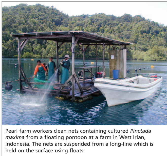
Pearl farm workers clean nets containing cultured Pinctada maxima from a floating pontoon at a farm in West Irian, Indonesia. The nets are suspended from a long-line which is held on the surface using floats.

This is demonstrated by the data in Table 2 showing that Australian pearls made up approximately 32 percent of total white South Sea pearl production in 2005 but accounted for almost 50 percent of the total value. However, Australia faces increasing competition from other producers who, one would assume, will be seeking to improve pearl quality. The Australian pearl industry is based primarily on adult oysters that are collected from the wild and used directly for pearl production (Wells and Jernakoff, 2006). The proportion of hatchery produced oysters used by the industry is therefore small (approximately 20 percent). Given that hatchery production provides the basis for selective breeding programmes, this strategy may, in the long term, favour other producers of white South Sea pearls, such as Indonesia, that rely on hatchery production.