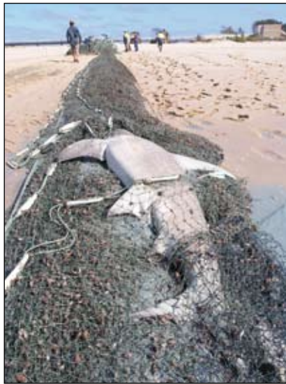
A 6 tonne Taiwanese gillnet with large entangled shark washed ashore in Arnhem Land.

Aboriginal rangers loading an ALDFG fishing net collected from the shore onto a truck for recycling/disposal, Arnhem Land, Australia.