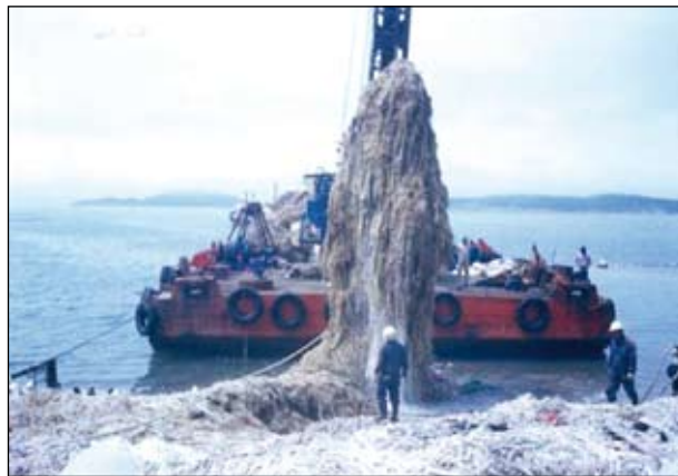
FIGURE 4 Recovery of ALDFG in the Republic of Korea