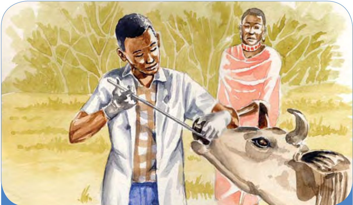
Veterinary officer administering medication to animal