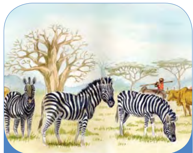
Livestock-wildlife resource sharing

Disease is more than a matter of microbes. Disease rates rise or fall depending on a large number of ecological and social factors. At the moment, both community members and scientists have observed livestock disease on the rise in pastoral areas.