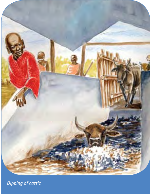
Dipping of cattle