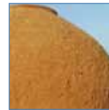
Mud granary