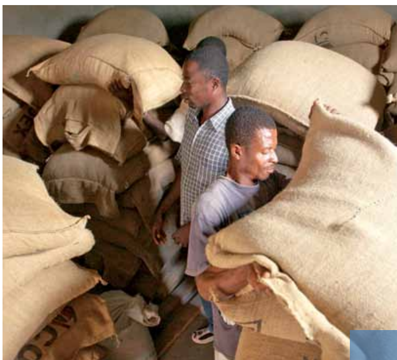
FARMERS STORING SACKS OF BEANS

Governments and donors should strengthen national capacities to integrate the planning and implementation of agricultural interventions that go beyond merely increasing production, including market-oriented infrastructure at community, district, regional and national levels, forming the basis for prioritization and budgetary allocation for such infrastructure at all levels. In addition, governments and donors should support training and empower users and local service providers to manage and maintain established market-oriented infrastructure effectively. These activities should be integrated into the relevant infrastructure budget frameworks. Ministries should support the training of stakeholders in pertinent areas such as partnership management, infrastructure maintenance, networking and market information systems management.