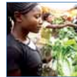
Women buying [...]