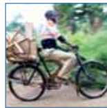
A boy transporting [...]