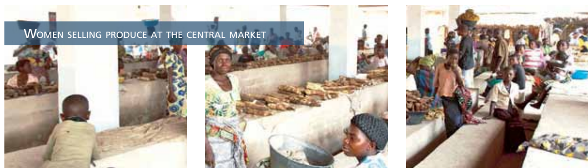
WOMEN SELLING PRODUCE AT THE CENTRAL MARKET

Capacity building and institutional strengthening will accelerate investment in market-oriented infrastructure and necessitate the coordination of