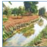
An irrigation canal [...]