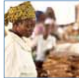
A vendor selling [...]