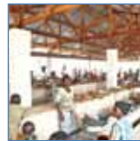
Women selling [...]