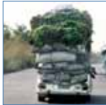
A car overloaded with cassava leaves