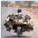
A poultry trader