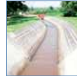
An irrigation canal