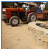
A tractor driving along a road