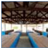
FAO-sponsored market