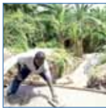
Man rebuilding the irrigation system