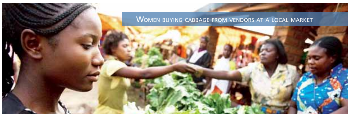
WOMEN BUYING CABBAGE FROM VENDORS AT A LOCAL MARKET

In order to maximize benefits from existing and future investments, it is essential for rural road networks to be linked to the main road networks and for both routine and any major maintenance to be carried out at appropriate intervals. Cost control can be achieved by introducing low-cost methods for repairing and sealing rural road surfaces. At the same time, access by overloaded