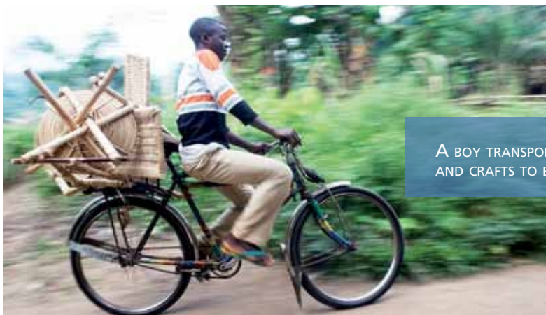
A BOY TRANSPORTING BY BICYCLE RATTAN FURNITURE AND CRAFTS TO BE SOLD AT THE MARKET

The government builds, owns and maintains the infrastructure but then contracts the private sector to provide the utility services for it. For example, this could apply to rural roads, where the government builds and owns the roads but private sector tractor service providers are contracted for maintenance and general transport tasks.