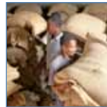
Farmers storing [...]