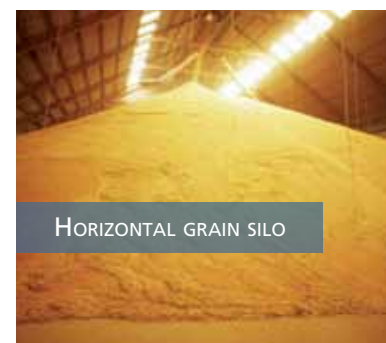
HORIZONTAL GRAIN SILO