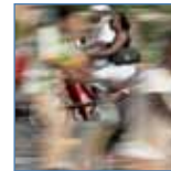
Street scenes [...]