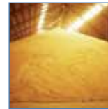
Horizontal grain [...]