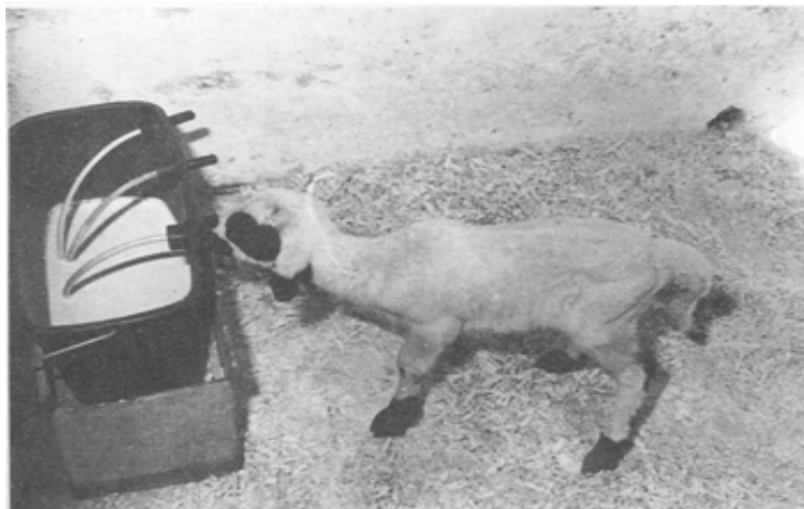
16. Lamb-bar - Portable plastic container fitted with nipples