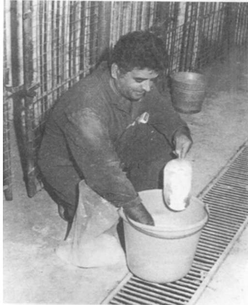
15. Milk replacer is reconstituted to give a dry matter of 20 percent

tube should be inserted into the rubber drinking nipple. The lower side of the plastic tube is provided with a non-return valve so that after the first and following actions of the lamb, the proper vacuum in the tube will be maintained until the liquid milk replacer arrives in the mouth of the lamb. The non-return valve maintains the column of milk in the tube, and there is no return flow of the fluid. When the rubber nipple is properly fitted to the plastic tube there is practically no loss of milk by leaking. The lower end of the plastic tube (with the non-return valve) should be inserted into the drinking pail near the bottom. The nonreturn valve is needed the first week only.