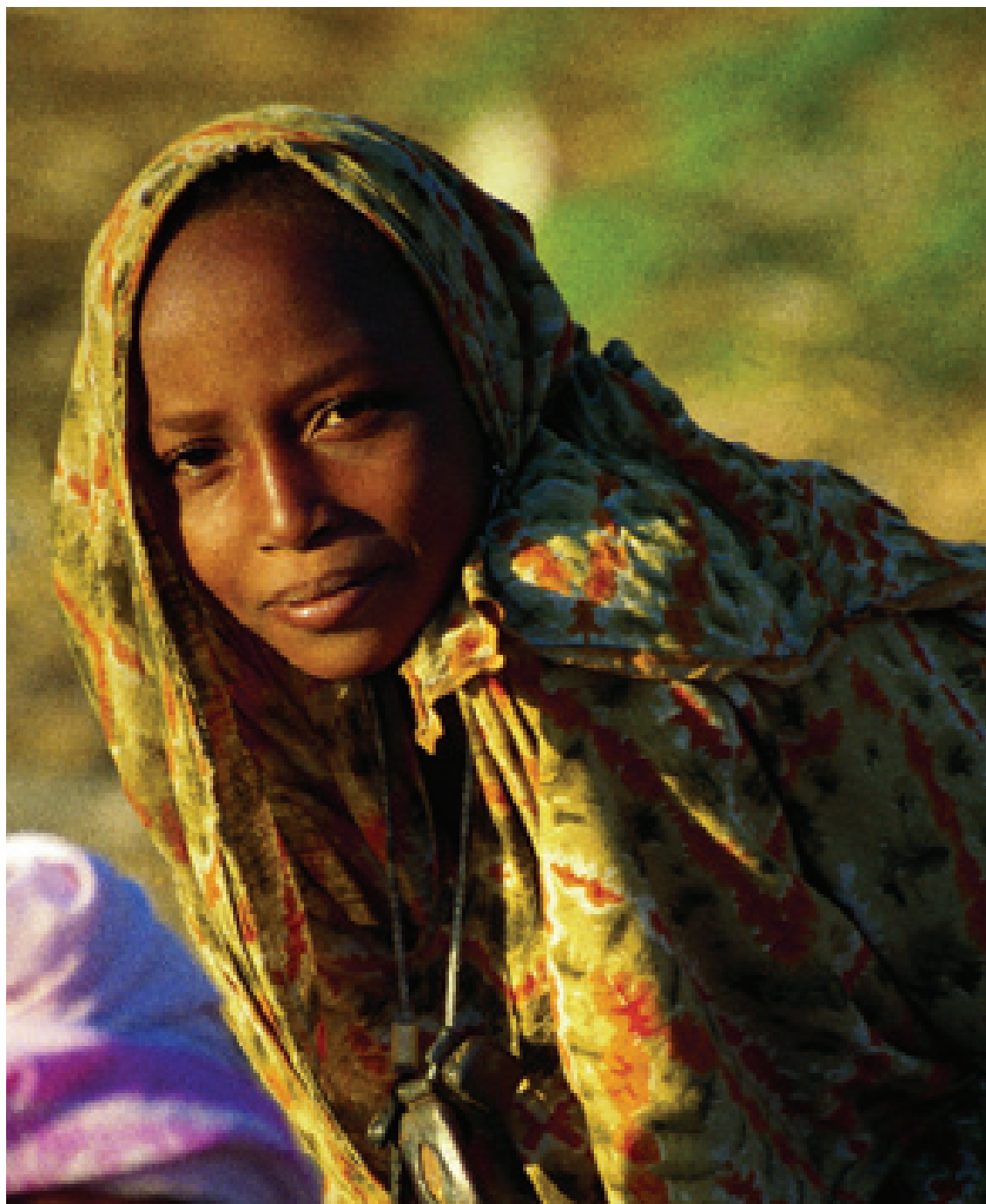
NEAR BOL, CHAD