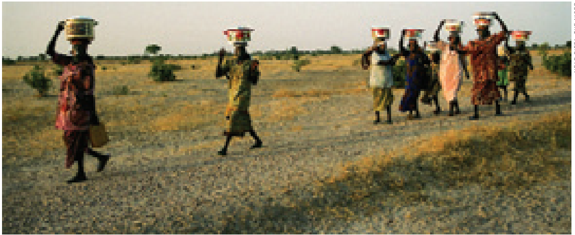
NEAR DIFFA, THE NIGER