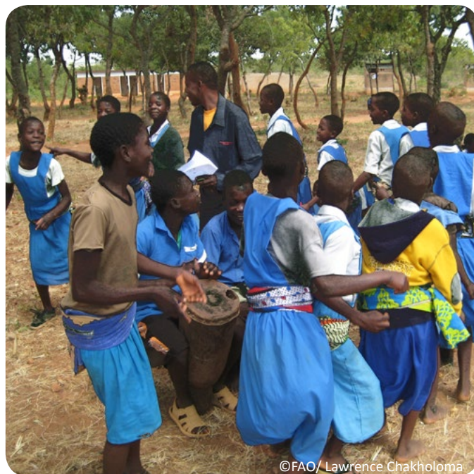
JFFLS students performing a song about food security messages at a Graduation Ceremony

In summary, the JFFLS approach is an important entry point for integrating nutrition into agriculture and ensures that the farmers of tomorrow adopt new knowledge and practices on diversified crop production for income generation and own consumption to improve the health and nutritional status of family members.