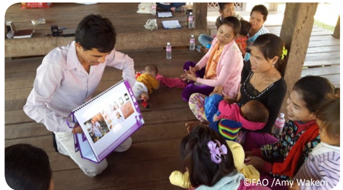
Caregivers learning about maternal diet in a nutrition education session

The 3,766 participating households received an average of USD 142 per household in input credit, which amounted to a total of USD 535,080 traded during the fairs. Participating households purchased more than USD 45,000 of kitchen equipment, such as: soap, stoves, food covers, cutlery, and water filters to enable the safe preparation of nutritious family food.