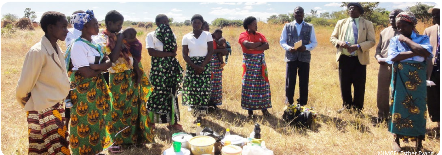
Caregivers presenting enriched porridges at a Graduation Ceremony