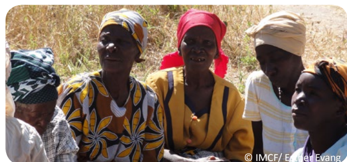
Caregivers and grandmothers participating in a discussion group on infant and young child feeding

"They are cheating you, how did we grow? Were we eating porridge with fish or vegetables? You are wasting your time."