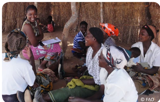
Caregivers participating in a focus group discussion for the process review

Process review findings and results of the IMCF project were presented at a joint FAO/JLU Dissemination meeting in Lilongwe on 18 February 2015.