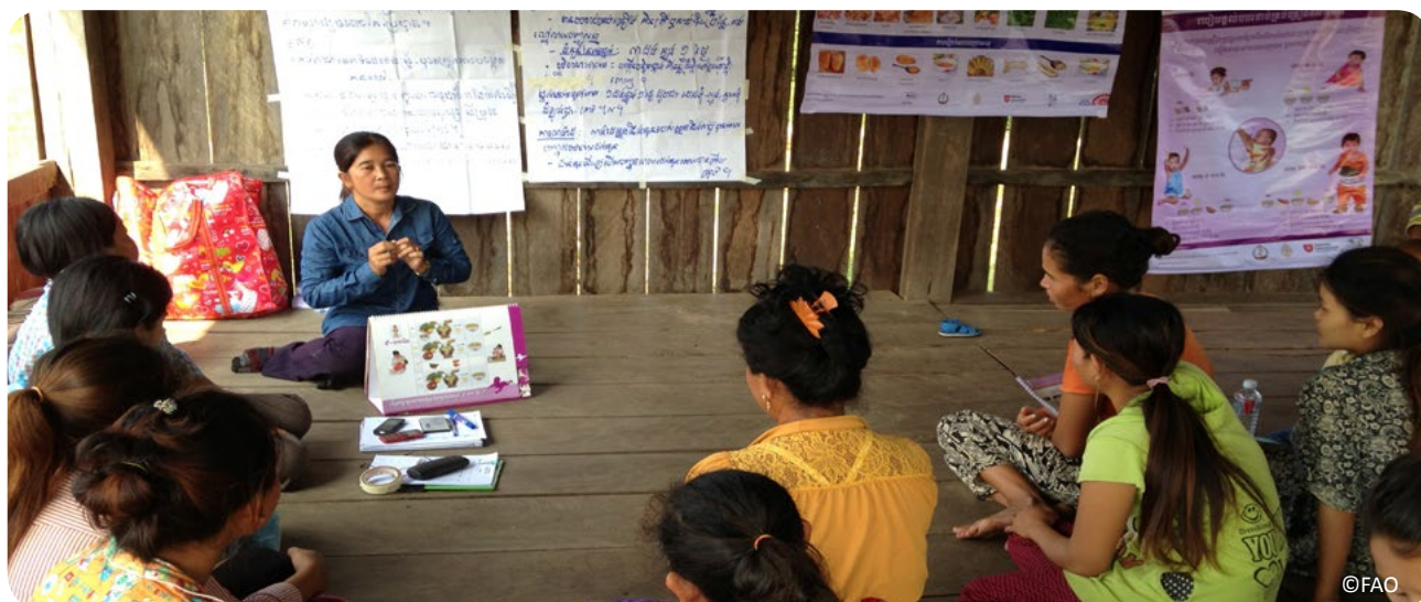
A CNP conducting a nutrition education session on age-appropriate feeding frequency