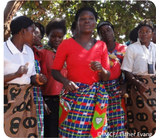
Caregivers performing nutrition songs during a Graduation

grandmothers, CNPs, members of Farmer Field Schools (FFS) and JFFLS students.