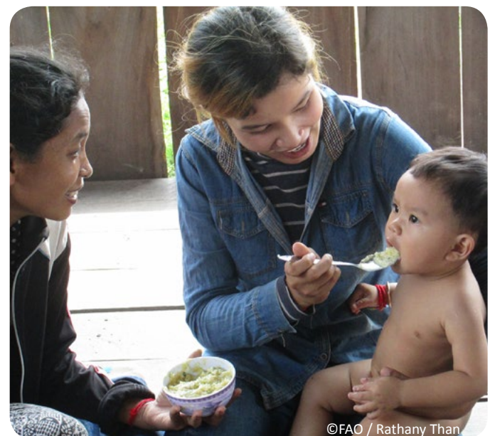
A young child being fed bobor at a cooking demonstration

The preliminary KAP test results showed that caregivers in both villages had increased knowledge of enriched porridge ( bobor khap krop kroeng ) consistency and feeding frequency, complementary feeding and hygiene.