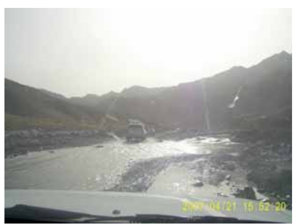
16. Espakeh to Chabahar (I.R. Iran)