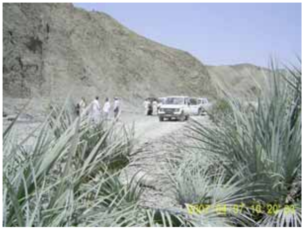
12. Panjgur to Turbat (Pakistan)