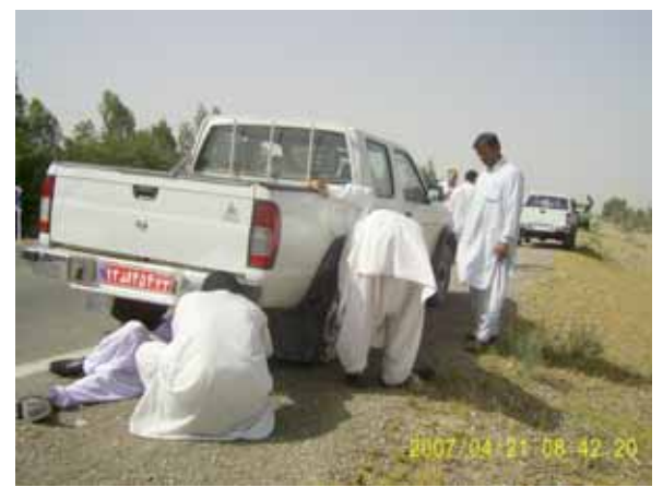
15. I.R. Iranshahr to Espakeh (I.R. Iran)