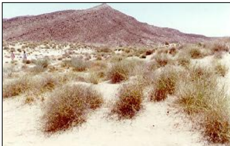
1. Poshti area in Chabahar (I.R.Iran)