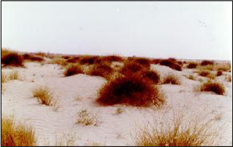
4. Shooli area in Turbat (Pakistan)