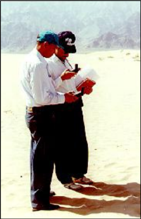
7. Team used GPS for determining the latitude and longitude of each survey stop