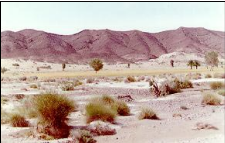
6. Suran area in Panjgur (Pakistan)