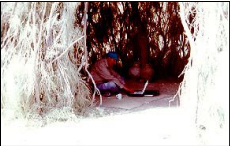
9. Team used a laptop notebook this year