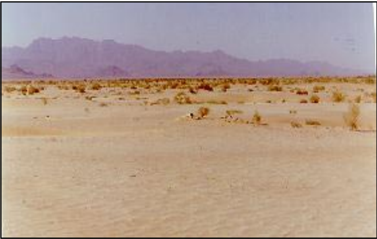
5. Jiwani area (Pakistan)