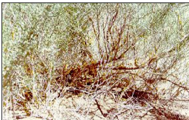
3. Memari area in Iranshahr (I.R.Iran)