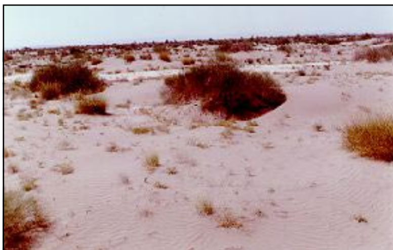
2. Beris area in Chabahar (I.R.Iran)