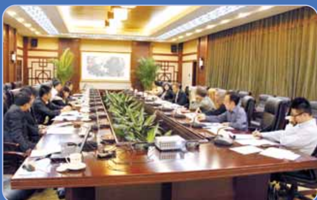
▲ 1st Steering Committee Meeting of the China FETPV

The 1st China FETPV Steering Committee Meeting took place on 21 September 2010 in the Ministry of Agriculture (MoA) of China. Representatives from MoA, FAO, Public health China Field Epidemiology Training Programme (CFETP), USCDC, China-Canada Livestock Health Extensive Services Project, China Animal Health & Epidemiology Center (CAHEC), and Beijing Animal Health Inspection Institute attended the meeting.