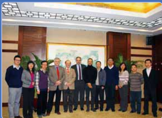
▲ Group photo for 3 rd China FETPV SC Meeting