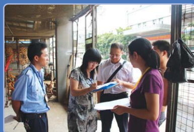
▲ Conducting social network analysis in Guangzhou

Representatives from Guangdong Provincial Veterinary Services, Guangzhou Animal Health Inspection Institute and relevant stakeholders from Guangzhou Jiangcun Poultry Wholesale Market attended the meeting on 2nd August. During the meeting, the action plan for market restructuring was presented, and seven bio-security