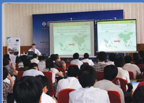
▲ China-EU Training to improve prevention and control of FMD