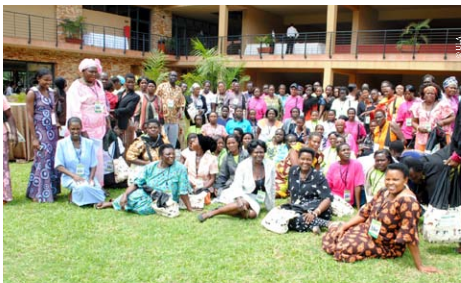
The 2010 National Women's Land Conference attracted some 350 women participants from all parts of Uganda.

The objectives of this conference were to raise a common voice for women and land; to provide a platform for women from different regions to share their challenges and experiences on land issues; to rejuvenate the women's national land movement; and to draw a minimum agenda for women and land. The conference attracted some 350 women participants from all parts of Uganda, including women representatives from all districts, parliamentarians, and representatives from NGOs, government ministries and departments, and the donor community.