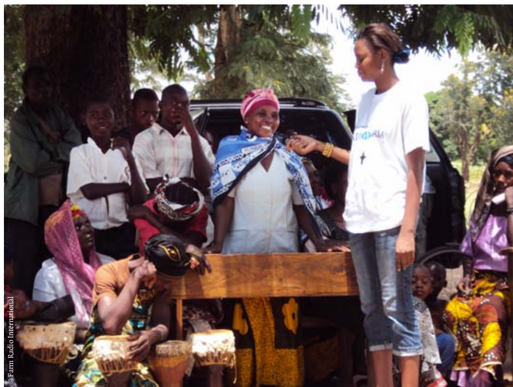
Radio programmes that broadcast the voices of fellow farmers are far more entertaining and interesting than others!

Power is another issue, because “when the computer is off, then Freedom Fone is down,”