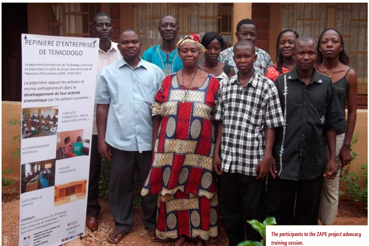
The participants to the ZAPE project advocacy training session.

The Réseau Femmes et Développement (RFA) is Dimitra's partner organisation in Burkina Faso. In this role, it has ensured the collection of information for Dimitra's database in the country.