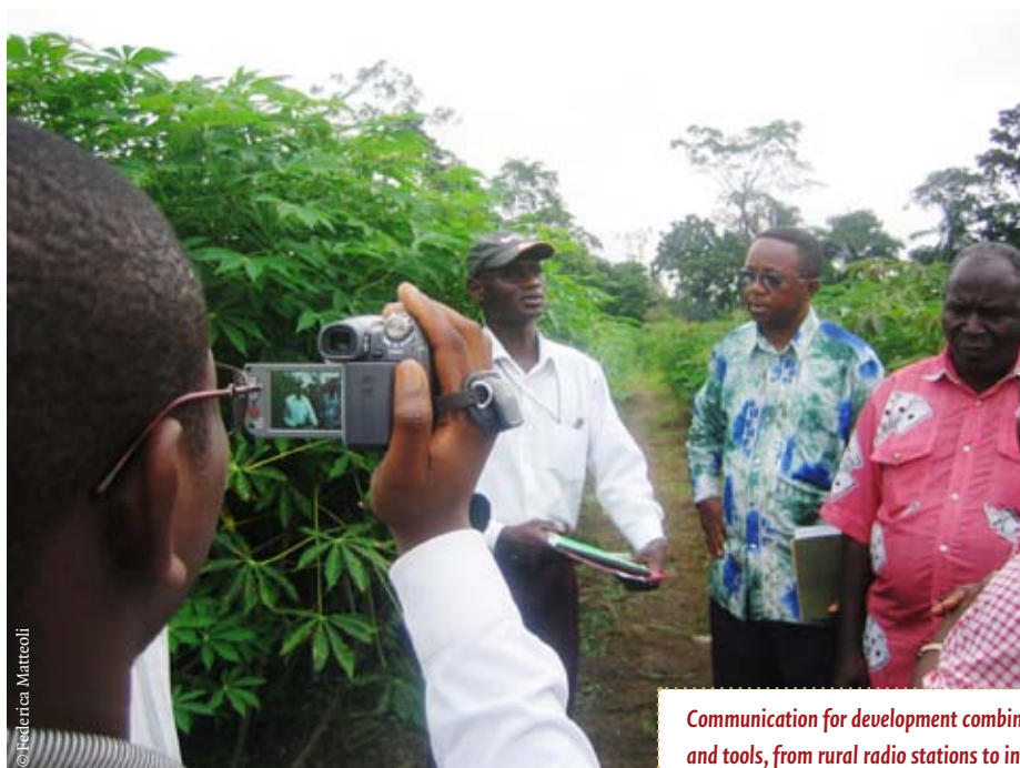
Communication for development combines participatory methods and processes with a range of media and tools, from rural radio stations to information and communication technologies.

For the past three years, the CSDI has been working in Mbanza-Ngungu, in the Cataractes district of Bas-Congo province, to sup-