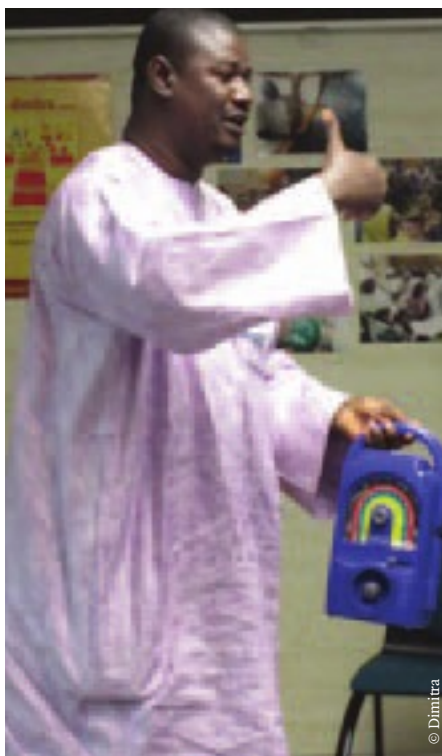
Dimitra organised a talk show at the Fair to present its community listeners’ clubs in Niger and the Democratic Republic of Congo.

Another session was facilitated by FAO’s Capitalisation of good practices project (part of the Belgium-funded Knowledge Management and Gender Programme) and discussed how inventory credit (warrantage) can be made equally accessible to both women and men, especially the most vulnerable. Experiences in Burkina Faso and Niger were illustrated. And a session on savings as a springboard to market readiness showed the dynamic force of rural women’s savings groups in Central America for moving women from ‘market-limited’ to