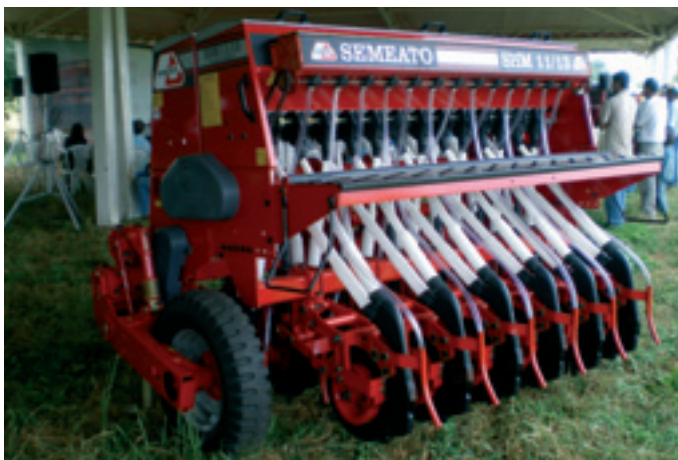
Figure 7. Multiseeder model SHM by Semeato.

With the expansion in the trade of machines adapted to NTS in Paraná in the early 1990s, Jumil decided to design a machine for the clay soils of the western area of the state that could be used all over Brazil. As a result, they developed the Magnum 2800, which sold around 500 units, and was one of the pioneer models in the use of auger-feed metering system for fertilizers. This model was an improvement on the Magnum 2000 that, in fact, was the first NTS machine produced by the company from the adaptation of the model Jumil 2000, developed back in the 1970s. The Magnum 2800 and the later models 2850 and 2880 were designed so that their structures and components could support heavier loads in the NTS and could cope with more demanding operational conditions with more powerful tractors, more speed and working depth in relation to conventional seeding.