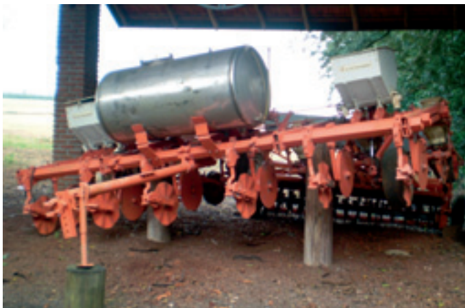
Figure 3. Planter model ALLIS CHALMERS in Herbert Bartz's farm, Rolândia, PR.

The positive results were apparent from the start, but it was during the energy crisis of 1973 that the economic benefits were evident due to the reduction of 60% of the work done with tractors. This aspect proved to be the main stimulus for the adoption of the no-till system both by Bartz himself and other producers. Bartz's main problems at the time were weed management, soil borne diseases and the difficulty of achieving good penetration of the seeder disks in clay soil, which affected soya germination. At this time, the Rotacaster equipment arrived from England and, with the help of technicians from the Brazilian representatives, it was assembled on his property. The biggest deficiency of the seeder