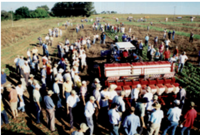
Figure 6. Dynamic exhibition of no-till planters in Guaíba, Paraná, in 2003.

In the mid-1990s, IAPAR realized that a lack of reliable technical information for the selection of commercial no-till seeders was an important limitation for farmers, and decided to evaluate the field performance of such machines in the main soil conditions found in the State, with the aim of generating subsidies for the farmers (Figure 6). From 1996 to 2003, more than 100 models of commercial precision seeders, seed drills and multiseeders were evaluated and it is estimated that approximately 5000 farmers and extension