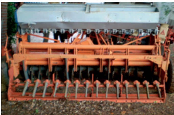
Figure 2. Planter model Howard ROTACASTER in Herbert Bartz’s farm, Rolândia, PR.

Bartz escorted an ICI study tour on a visit to barley and wheat producers in England who were practising no-till with a machine similar to the ‘Rotacaster’ (Figure 2), with surprising results, mainly in relation to water conservation. Subsequently he traveled