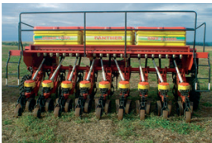
Figure 8. Multiseeder model Panther by Vence Tudo.

for family agriculture, for which it was awarded the Gerdau prize “Improvement of the Land” 5 at Expointer. An important quality leap was the development of the “jump-stone” system, with articulation in the disc coulters support for safe working in stony conditions. This increased the demand, including that for large and small-sized machines. Nowadays, the SA is manufactured with 3 to 7 rows for soya and 7 to 14 rows for wheat. In 2000 the company began to structure an export department, starting in Colombia in 2001, although they already had foreign commercial experience with Uruguay and Paraguay. The export demands came mainly from the fairs such as Expointer, Agrishow and Show Rural. Through ABIMAQ they met Intrac Trading, which became the company’s representative in South Africa. They went to Mexico, the United States and, mainly through FAO, their products have been disseminated in Latin America, Asia and Africa. In the first six years of the export department’s existence, the company did business with 20 countries. In 1998 the Brazilian savanna started its big expansion and Vence Tudo began to participate in it with the