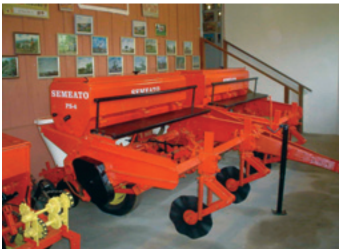
Figure 4. Semeato planter model PS6 in the Nono Pereira’s farm museum.

ICI, he surprised them when he maintained that wheat was the most harmful ‘weed’ in crop production. The fact was that wheat grains germinated after the use of the Rotacaster due to soil disturbance, stimulating germination and producing a weed problem if chemical control was not effective. In the 1976/77 crop, Nonô consulted Franke Dijkstra, who had used a Semeato PS6 to successfully sow through wheat straw by using double disk openers for fertilizer and seed similar to the conventional system. In December 1976, at the end of the recommended planting window, Nonô sowed soya with a PS6 on rye straw cut 1 meter high, with excellent results in both yield and weed control. After this experience, he attached a tool bar to the front of the PS6 to locate a vertical cutting disk in a way similar to what Dijkstra had done (Figure 4). Besides, the PS 6 presented some advantages in relation to the Rotacaster as it was trailed and had independent hydraulic controls which made it ideal for traversing terraces. The Rotacaster, on the other hand, was heavy and three-point linkage mounted, which, even with front ballast on the tractor, could cause rearing up and damage to the