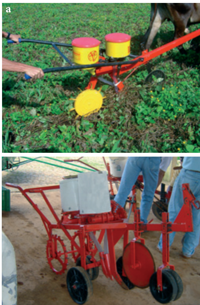
Figure 10. Animal powered no-till planter models Werner (a) and Triton (b).

Knapik, from Porto União (SC), was founded in 1985. At first it worked with agricultural machinery maintenance and repair, but soon started to develop equipment for small farms in the region. The